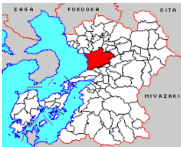
Kumamoto in red

war. By the end of the war, almost all the city from the station to the Suizen Temple had been reduced to a burnt-out wilderness. Reconstruction did not get underway properly until around the time of the Korean War, and even when I was born the dark scars of war still lay over the landscape.