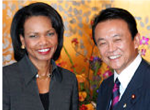
Rice in Japan with Foreign Minister Aso Taro.

Thus, via this last factor, the United States has continuing and unique ability to influence Pyongyang’s decision on when and if the DPRK conducts more nuclear tests.