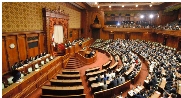
Passage of Anti-Conspiracy Bill in House of Councillors, June 15, early morning

—Following the State Secrecy Act and new security legislation, the Abe administration is aiming to force through the anti-conspiracy bill. What dangers do you think that presents?