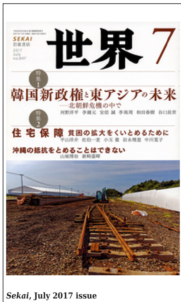
Sekai , July 2017 issue