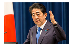
PM Abe Shinzō addressing Nippon Kaigi's 20 th anniversary gathering, 27

最後に、本大会の御盛會と、皆様の一層の御発展を祈念して、私からの祝辞といたします。