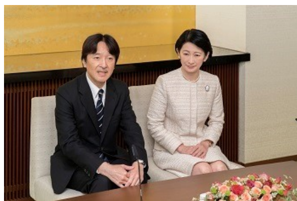
Prince Akishino no Miya Fumihito 秋篠宮文仁 with the Princess at his birthday press conference, November 2018 32

Emperor Akihito's daijōsai , the first in the postwar era, took place on the night of 22-23 November 1990. It had the distinction of being the first ever to cause legal controversy. The controversy and its resolution deserve to be more widely known. Articles 20 and 89 of the Constitution provide for the separation of state and religion. And yet, the state funded the daijōsai , which is "religious" to the extent that it features the Sun Goddess. The government fended off accusations of unconstitutionality by citing the "object and effect" principle established in a landmark Supreme Court ruling in 1977. 30 The essence of the ruling was that the state may engage with religion, so long as neither the "object" nor the "effect" of its engagement amounts to the promotion of any specific religion. The government's position was that public funding of the daijōsai contravened neither criterion. Many citizens' groups disagreed, and took legal action, but their suits all foundered on the "object and effect" principle. 31