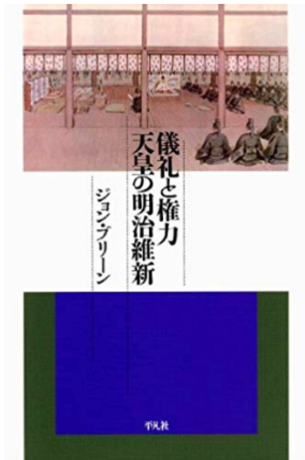
Girei to kenryoku: Tennō no Meiji Ishin 儀礼と権力 天皇の明治維新 Heibonsha, 2011.