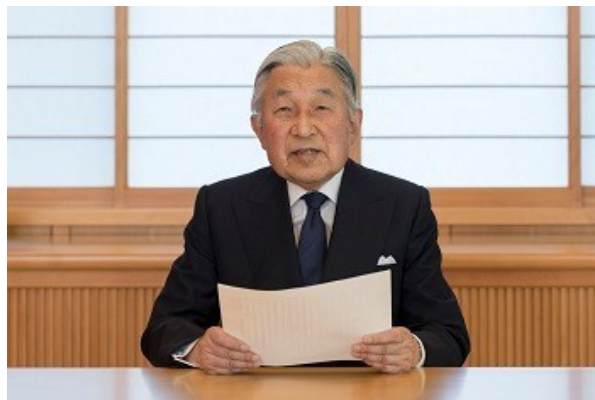
Emperor Akihito delivering his address to the nation on NHK, 8 August 2016 3

The emperor began by framing his reign as a personal search for meaning. He had dutifully carried out the “acts of the emperor in matters of state” as stipulated in Article 7 of the Constitution. These include convocation of the Diet, dissolution of the House of Representatives, attestation of ministerial appointments, awarding of honors, and so on. However, he had “spent [his] days searching for and contemplating on” the meaning of Article 1’s designation of him as “symbol of the State and of the unity of the people.” The Constitution, after all, fails to elucidate what action is required of, or indeed permitted to, a “symbol of the State.” The emperor’s search led him to conclude that he must serve as “an active and inherent part of society, responding to the expectations of the people.”