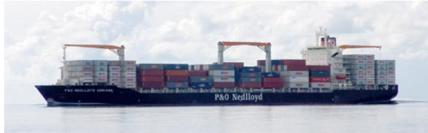
Cargo ship in the Straits

not matched their extensive usage of the Straits with proportionate contribution to the costs of maintaining and securing it.