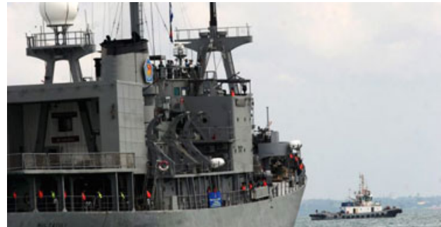
An Indonesian navy ship patrols the Straits

safety in the Straits, Indonesia has called for international burden sharing as provided for by the Article to be enhanced and expedited [4]. From its perspective, any discussion of the subject should include both the littoral and user states, and should never undermine the sovereignty of the latter.