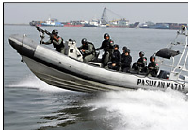
The navies of Singapore and Indonesia hold a joint exercise in August 2006

Since 9-11, many steps have been taken to improve security in the Straits. These include the MALSINDO coordinated patrol by the navies of the littoral states, the 'Eye in the Sky' air surveillance over the Straits, the creation of the Malaysian Maritime Enforcement Agency (MMEA), and increased patrols conducted by the littoral states.