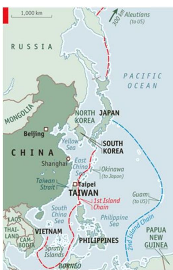
From “China’s military rise - the Dragon’s new teeth,” The Economist , 7 April 2012

Intent on maintaining strategic and tactical superiority over China and defying its “A2/AD” aspirations in advance, the US in 2010 developed what it refers to as its “Air-Sea Battle” concept, followed early in 2011 by the “Pacific Tilt” doctrine. The commitment under the former to coordinated military actions across air, land, sea, space, and cyber space to maintain global hegemony and crush any challenge to it, and the shift under the latter of the US’s global focus from the Middle East and Africa to East Asia have profound implications for Okinawa. From the Chinese viewpoint the Okinawan islands resemble nothing so much as a giant maritime Great Wall intervening between its coast and the Pacific Ocean,