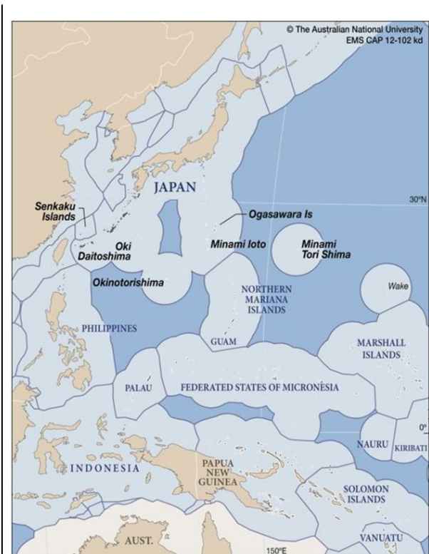
China, Korea and Western Pacific EEZs

The 1982 agreement was almost a decade in the making (1973-1982), took another decade before coming into force, in 1994, was ratified by Japan in 1996, and by 2011 had been adopted by 162 countries. It aimed to set international standards and principles for protection of the marine wildlife and environment and provide a forum for resolution of disputes over boundaries and resource ownership. It gave coastal nations jurisdiction over approximately 38 million square nautical miles of ocean, which are “estimated to contain about 87 per cent of all of the known and estimated hydrocarbon reserves as well as almost all offshore mineral resources” and almost 99 per cent of the world’s fisheries. 1 The United States, though participating in the various conferences since 1982 and claiming the largest exclusive economic zone in the world, covering 11,351,000 square kilometres in three oceans, the Gulf of Mexico, and the Caribbean Sea, is one of the few that has not ratified the agreement, evidently in keeping with the reluctance to compromise US exceptionalism by submitting to the authority of any international law. 2