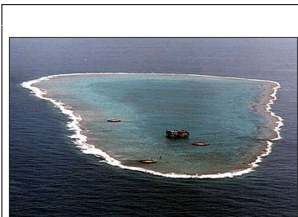
Okinotorishima (from Wikipedia)

port infrastructure, a power generation plant, housing, etc. 9 A very considerable sum, estimated at $600 million, has been outlaid on concrete and titanium to date as part of Tokyo’s mission to retain Okinotorishima and a surrounding EEZ. 10