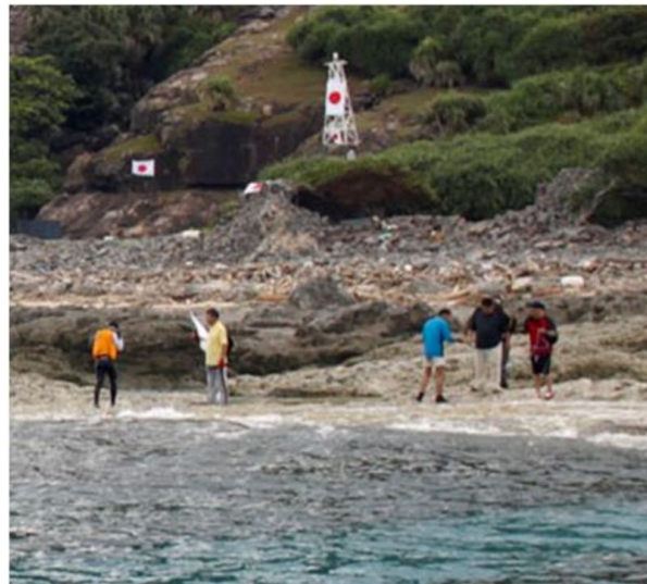
Japanese party landing on Senkaku/Diaoyu Islands, 19 August 2012

including national and local assembly politicians and Ganbaru Nippon's head, Tamogami Toshio (former Chief-of-Staff of Japan's Air Self-Defence Force and a noted right-wing revisionist and agitator) and members of the National Diet's "Dietmembers acting to protect Japan's territory") sailed from the Okinawan island of Ishigaki, planted Japanese Hinomaru flags and conducted ceremonies to commemorate Japan's war dead. They were given a pro forma official rap over the knuckles for having done so without authorization, accompanying a generally positive and congratulatory national reception.