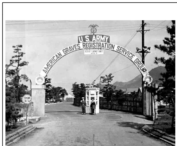
Camp Jono, Kokura, Japan