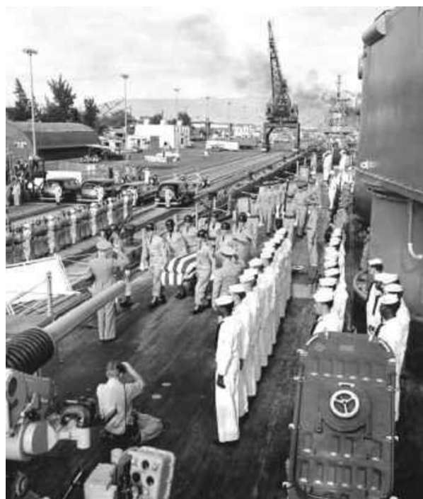
Unloading bones at Kokura

skeleton to be completed for each body. (The instructions on the diagram read, 'black out parts of body not received'). 27