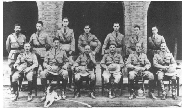
Figure 2: George Orwell (back row, third from left) doing his police training in Burma in 1923.

DK: Though he wrote eloquently against empire all through his career, he found it difficult to unlearn the cultural assumptions that came with his upbringing and his experience in the colonised East. From time to time, we can find in his writing casual descriptions of Burmese and Indian people which may strike a modern reader as patronising or disrespectful, or worse. And though he was perfectly clear that the empire was 'an old-fashioned and rather shaky despotism' that could not be justified and should be dismantled as soon as possible, he was not prepared to say either that it was all bad or that the nationalism which would inevitably succeed it would be, shall we say, unproblematic. All this is to say that to be anti-imperialist in the twenty-first century is a relatively simple matter, but for Orwell it was not so. And if we want to recruit him for our contemporary struggles, we should read him carefully first, and take account of the historical circumstances in which he wrote. My book tries to re-historicise Orwell in this way. He was born in 1903. He is not our contemporary.