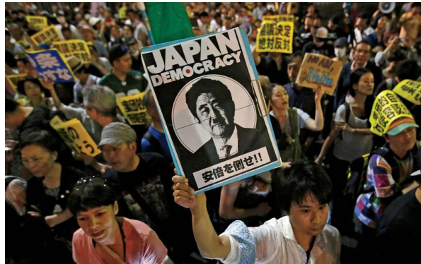
A wave of protest against Prime Minister Abe's call for constitutional revision.