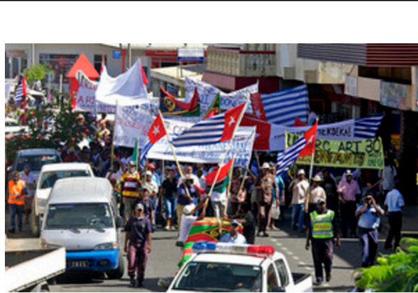
Rally for West Papuan independence in Port Vila, Vanuatu, March 5 2010. Image credit: Asia-pacific-action.org. Original image location

leaders are fearful of losing MSG support for their cause as the West Papua issue promises to be an ongoing and possibly explosive one for the organisation.