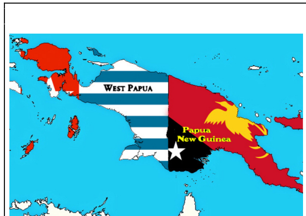
New Guinea island divided between Papua New Guinea and West Papua (or the Indonesian provinces of Papua and Papua Barat).

spokesperson for Fijian opposition party the United Front for a Democratic Fiji has accused Indonesia of meddling in Fijian internal affairs by offering support for Fijian Prime Minister Commodore Bainimarama in anticipation of his re-election that occurred in September 2014, and buying off support for West Papuan self-determination 65 .