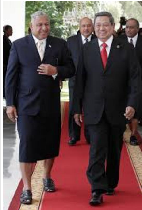
Bainimarama and Yudhoyono.

This open diplomatic confrontation was evidence that Indonesia's diplomatic offensive over West Papua was well underway. Despite the heartfelt support for the West Papuan struggle within the Vanuatu government and the country as a whole, this sentiment is much weaker in the other Melanesian countries. Their support for the cause has waned as their financial and strategic relationship with Indonesia has blossomed, and it is hard to separate these two developments. The financial and strategic support from Indonesia can be clearly linked to the withdrawal of support by the MSG states for West Papua. The clearest example of this has been Fiji.