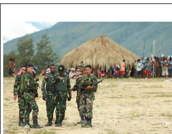
TNI troops in Nduga in January 2019, with a Papuan hut (honai) and local community in the background.