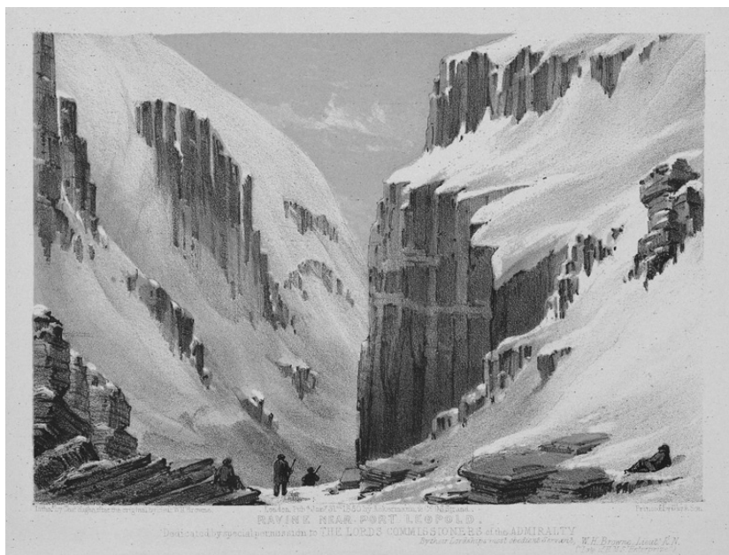
Figure 5.4 William Henry Browne, Ravine near Port Leopold , 1850. Lithograph, 12 × 17.5 cm. Royal Collection Trust / © Her Majesty Queen Elizabeth II 2021.

Few of Browne's lithographs show the struggle that becomes more pronounced in the later lithographs of Cresswell and May, where the heroic self-sacrifice of the search is made clear. Certainly, the figures at ease in the environment in Coast of N. Somerset – Regent's Inlet , and in some of Browne's lithographs, would seem to suggest contemplation rather than action. Nowhere is this more evident than in the lithograph Ravine near Port Leopold (Figure 5.4). The seated figure on the left is offset by a reclining figure in the right-hand corner, who contemplates the scene in a Romantic