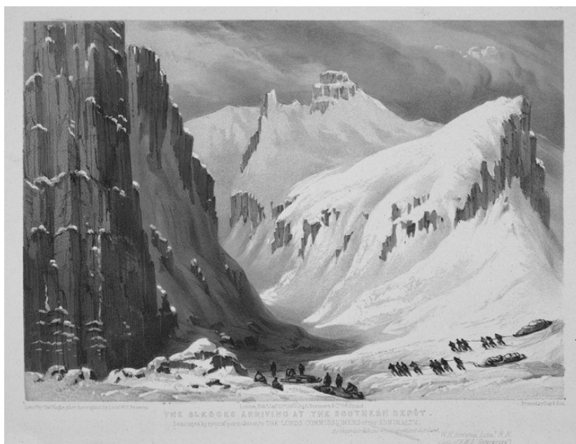
Figure 5.2 William Henry Browne, Prince Regent's Inlet , 1850. Lithograph, 24.5 × 17 cm.

of these scenes, of a very striking kind', singling out The Bivouac as an example. 52