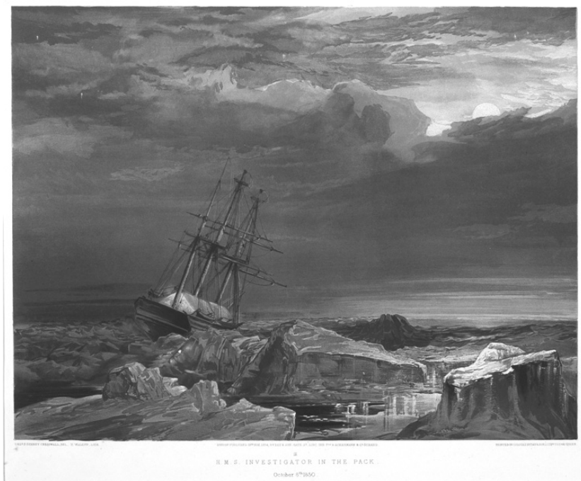
Figure 5.6 Samuel Gurney Cresswell, H.M.S. Investigator in the Pack . October 8th 1850, 1854. Lithograph, 44.3 × 61.2 cm.

monochrome sketch, probably indicative of the only materials then available to Cresswell, two or three comparatively large figures walk on the ice, which appears more stable than in the lithograph. In the latter, the glow of light coming from the ship points to a spark of humanity that poignantly highlights the inhuman aspects of the ice pack.