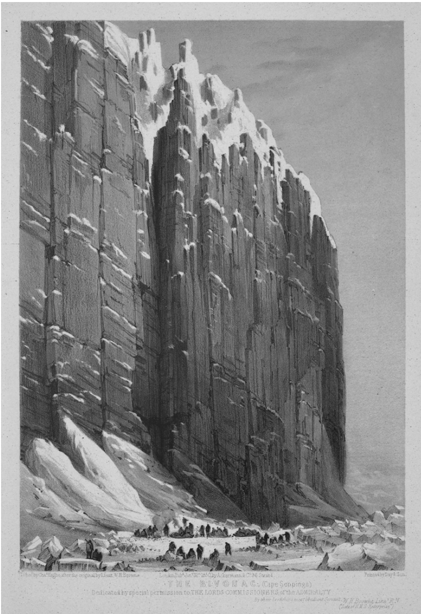
Figure 5.1 William Henry Browne, The Bivouac, Cape Seppings, Leopold Island , 1850. Lithograph, 24.5 × 17 cm.