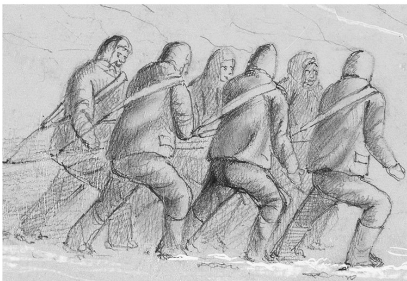
Figure 5.8 Detail from Walter William May, Loss of the McLellan , 1852. Watercolour; pen and ink (top). Detail from Walter William May, Cape Lady Franklin , 1852/4. Graphite (bottom).