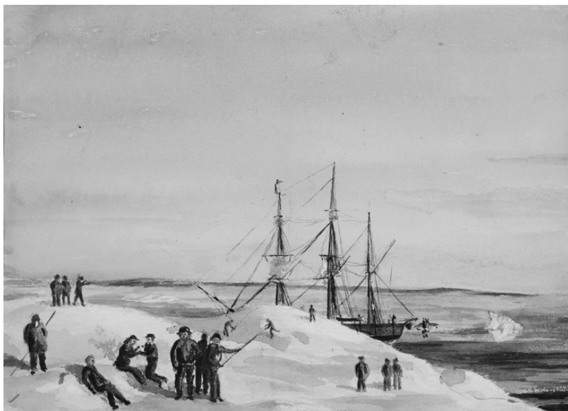
Figure 5.5 Samuel Gurney Cresswell, Brown's Island, Coast of America , August 1850. Watercolour, 18.2 × 25.5 cm.

In contrast to the lithographs, one of Cresswell's paintings from the voyage, Brown's Island, Coast of America (Figure 5.5), shows men scattered about in a relaxed manner under a blue sky in August 1850. 72 The painting reflects the periods of inactivity that were inevitably typical of search expeditions. In the foreground of this painting, a figure reclines (bottom left) while, nearby, two sailors light their pipes; other groups of men stand around, close to the partly concealed ship. The scene has an air of quiet joviality and restfulness, not commonly seen in the public representations. The lithographs instead highlight discovery and difficulty, new lands, and the ship in peril. The first lithograph in the series immediately opens with a 'discovery'. First Discovery of Land by H.M.S. Investigator, September 6th 1850 (40.5 × 55.9 cm), lithographed by Simpson, sets the tone for the entire production. In this plate, the water is black, only serving to make the novel ice stand out more, while the land in the distance is overshadowed by an ominous sky of dark clouds. The scene is melancholy, suggesting perhaps difficulties to come as the Investigator , alone under a threatening sky, weaves her way through ice floes seemingly impossible to navigate.