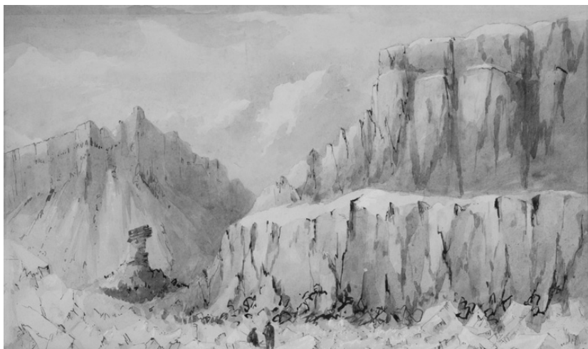
Figure 5.3 William Henry Browne, Coast of N. Somerset – Regent's Inlet, near Cape Leopold , 1849. Watercolour, 20.5 × 34.5 cm.

In contrast, the lithograph Prince Regent's Inlet (Figure 5.2) shows a very different scene. 57 At first glance, the watercolour and the lithograph appear to have little in common apart from the place name in their titles. On closer inspection, it becomes evident that the lithograph is compositionally almost a mirror image of the watercolour and may also present the view from a different angle. Noticeable too is the way in which enormous quantities of snow lie heaped up in the lithograph, in contrast to the relatively light layers of snow in the watercolour. The blue sky of the watercolour has disappeared, replaced by a stormy and ominous backdrop,