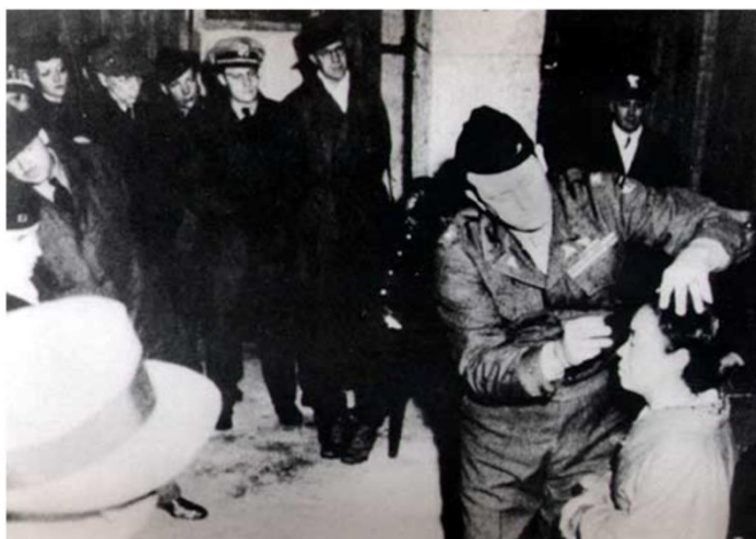
ABCC examination of Hiroshima victim

The Japanese physicians and scientists who’d been on the scene told horrific stories of people who’d seemed unharmed, but then began bleeding from ears, nose, and throat, hair falling out by the handful, bluish spots appearing on the skin, muscles contracting, leaving limbs and hands deformed. When they tried to publish their observations, they were ordered to hand over their reports to US authorities. Throughout the occupation years (1945-52) Japanese medical journals were heavily censored on nuclear matters. In late 1945, US Army surgeons issued a statement that all