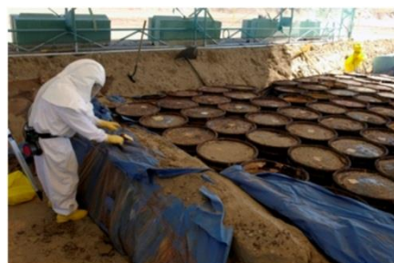
Worker with radioactive waste at Hanford

In the Hiroshima and Nagasaki studies, by contrast radiation exposure was estimated on the flimsiest of guesswork. The radiation emitted by the bombs was calculated according to tests done in the Nevada desert and was recalculated several times in subsequent decades. Researchers asked such questions as, where were you standing in relation to the blast, what was between you and it, what had you had for breakfast that morning, assuming that the survivors would give