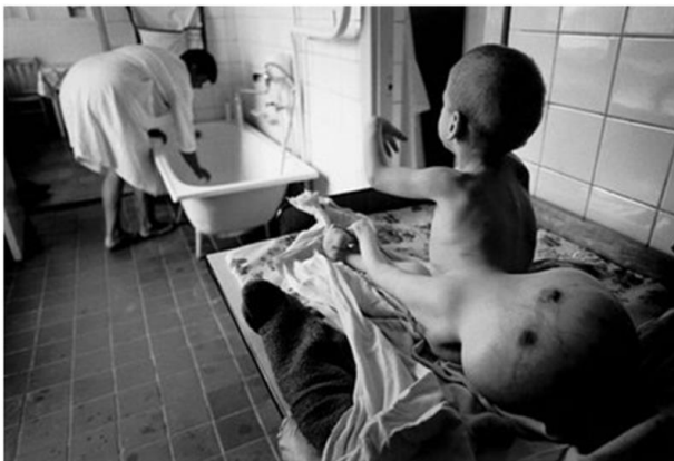
Chernobyl legacy.

But the parallels are political, not biological, for the Hiroshima data have proven to be an "outdated" and useless model, as Stewart said, for predicting health effects from low-dose, chronic radiation exposure over time. The Hiroshima studies find little genetic damage in the survivors, yet Yablokov et al. document that "Wherever there was Chernobyl radioactive contamination, there was an increase in the number of children with hereditary anomalies and congenital malformations. These included previously rare multiple structural impairments of the limbs, head, and body," devastating birth defects, especially in the children of the liquidators. The correlation with radioactive exposure is so pronounced as to be "no longer an assumption, but... proven," write the authors. As in humans, so in every species studied, "gene pools of living creatures are actively transforming, with unpredictable consequences": "It appears that [Chernobyl's irradiation] has awakened genes that have been silent over a long evolutionary time." The damage will play out for generations — "at least seven generations."