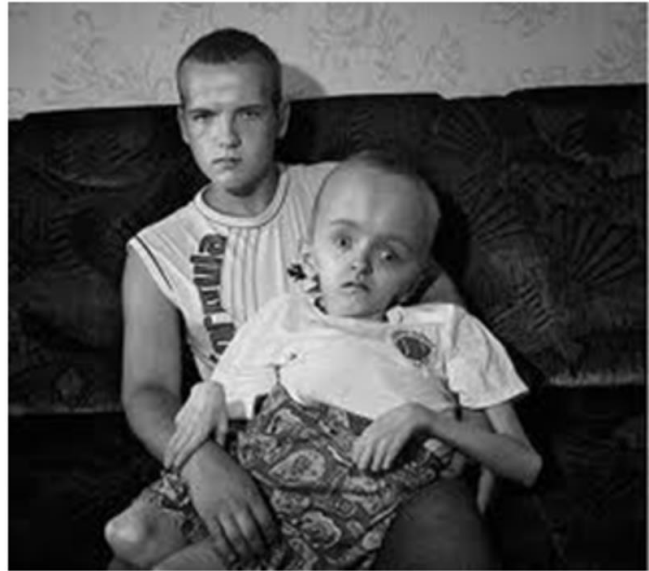
After Chernobyl.

Parallels between Chernobyl and Hiroshima are striking: data collection was delayed, information withheld, reports of on-the-spot observers were discounted, independent scientists were denied access "The USSR authorities officially forbade doctors from connecting diseases with radiation and, like the Japanese experience, all data were classified." With the "liquidators," as they're called, the 830,000 men and women conscripted from all over the Soviet Union to put out the fire, deactivate the reactor, and clean up the sites, "It was officially forbidden to associate the diseases they were suffering from with radiation." "The official secrecy that the USSR imposed on Chernobyl's public health data the first days after the meltdown... continued for more than three years," during which time "secrecy was the norm not only in the USSR, but in other countries as well."