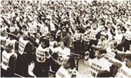
Mindan-organized anti-fingerprinting rally of 15,000 at outdoor Hibiya Hall, Tokyo in 1983

The resistance to fingerprinting was bound up with other means of asserting ethnic existence. As early as the late 1960s there were sporadic initiatives to use ethnic Korean names in Osaka, and individual “comings-out”—to use one’s “real name” [ honmyo ] instead of Japanese name [ tsumei —occurred throughout the 1970s. As a 1970s pamphlet stated, “the use of tsumei itself is clearly a form of ethnic discrimination.” Arguing against the practical benefits of passing, activists sought not only to promote ethnic pride but also to extirpate discrimination. The “real name” initiative marked the limits of passing in the