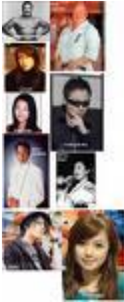
Zainichi diversity among the famous and the popular

Hwang, Kyo, and Yu are Zainichi, but they reveal little commonality. Surely, we can seek their differences in part in their divergent backgrounds: gender, region, class, and so on. These social differences exist alongside different courses and contours of their lives. But this is precisely the point. Beyond the sheer diversity of Zainichi professions and personalities, genders and generations, likes and dislikes, we should not forget that an individual is neither unitary and homogeneous nor stationary and unchanging. Virginia Woolf observes in Orlando that “a biography is considered complete if it merely accounts for six or seven selves, whereas a person may well have as many as a thousand.” Although “the conscious self . . . wishes to be nothing but one self . . . ‘the true self,’” it cannot squelch distinct moments and conflicting recollections, ambiguities and multiplicities. Kyo would expend considerable time studying and living in South Korea, and thereafter exploring the distinct trajectories of the Korean diaspora across Asia. Yu would also learn Korean and go on to write novels and stories with strong Korean and Zainichi themes and characters. In other words, temporal