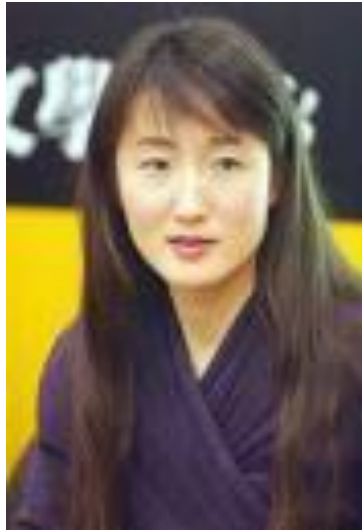
Yu Miri: a best-selling author and a figure of controversy

Yu characterizes herself as a runaway [ toposha ], as someone who flees not to hide but simply to run away. Her adolescence—though common enough among adolescents—is a series of shameful, embarrassing moments and memories. She is ashamed of her aunt, whom one of her friends mistakes for a beggar, as well as the meager lunch she takes to school. She is troubled by her mother taking up a lover and abandoning home for days at a time. Enrolling in a prestigious middle school at her mother's request, she merely yearns to leave. Although she finds friends from time to time, she feels closer to dead writers than to any living people. "I was closer to the dead than to the living. In my bag were books by [the poet] Nakahara Nakaya and [the novelist] Dazai Osamu, and I could only talk easily with the dead. The living inevitably hurt me, but the dead forgave and cured me." She develops a crush on a classmate but is rebuffed: "I don't know what I wanted from her. It was not to become closer or to touch her body or to be touched. Thinking about it now, perhaps I was inviting her to die with me." She "woke up every morning