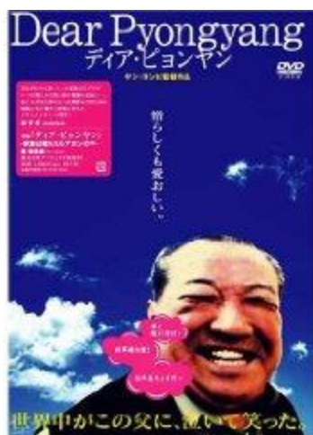
Dear Pyongyang: an award-winning documentary that is part of a reconsideration of Zainichi affinity toward North Korea

In promoting diasporic nationalism, Zainichi ideology erects a prison-house of Zainichi-ness, a collective confinement to ethnic essentialism. Beyond establishing the fundamental pillars of Zainichi identity, it also projects an idealized Zainichi self that mirrors Zainichi historiography: the dialectics of oppression and resistance, poverty and struggle. It also prescribes, like Soren ideology, cultural nationalism, such as learning Korean language, history, and culture, and retains instinctive suspicion of Japan and discourages assimilation.