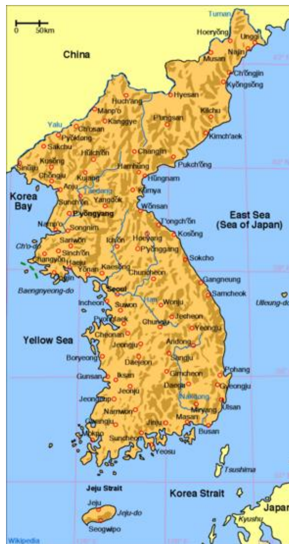
Map of the Korean Peninsula

Socially and culturally Jeju Islanders have been open to the peoples with which they came in contact, while the island was politically subordinated by its larger land-based neighbours. This openness, in conjunction with political subordination, did not mean that Jeju Islanders assimilated. Rather, they managed their political and cultural relations so as to maintain a measure of autonomy and cultural distinctness. This history of Jeju Island contributes to the understanding of the nation-state from the perspective of minority ethnic groups, especially those living across territorial borders.