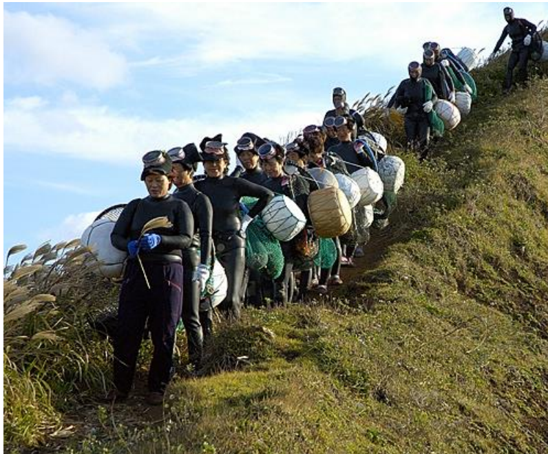
Contemporary Jeju women divers

Although Jeju Islanders' early efforts at resisting Japanese incursions into their fishing areas failed and they moved on to adapting to the new political situation, more bursts of resistance against Japanese rule followed in the 1930s (Yang 1996). Jeju's women divers played a key role in some of these movements (Fujinaga 1989). By then they had fishing rights to the whole Korean peninsula and were used to organizing themselves economically, so although they had no formal schooling, it was a small step for them to form groups to actively agitate for change in areas where their rights were abused.