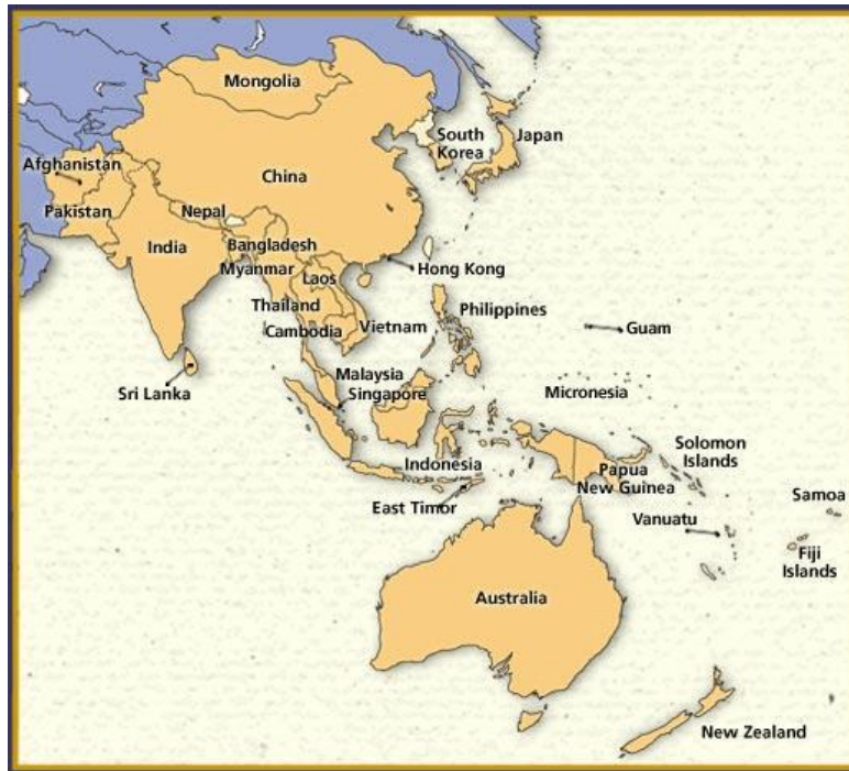
Map of the Western Pacific

Despite centuries of subjugation by larger neighbours—Joseon Korea, Imperial Japan, and South Korea—Jeju island society has maintained a distinct identity and a measure of autonomy. Relations with both Korea and Japan have at times had devastating effects on the islanders, but also contributed to the dynamism of Jeju island society and opened up new routes for islanders to continue traveling as a vital part of their social life.