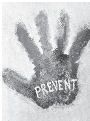
Title: In Our Hands , 2023

Beginning with volume 43 (January 2022), the cover of Infection Control & Hospital Epidemiology (ICHE) will feature art inspired by or reflective of topics within the scope of the journal and their impact on patients, healthcare personnel and our society. These topics include healthcare-associated infections, antimicrobial resistance, and healthcare epidemiology. The intent is to feature original artwork that has been created by individuals who have a personal connection to one or more of these topics through their clinical work, research, or experience as a patient or an affected patient's family member, friend or advocate. The goal is to provide readers with a visual reminder of the human impact of the topics addressed in the journal and the importance of the work being done by those who read or contribute to ICHE and by all who are trying to make healthcare safer through the elimination of healthcare-associated infections.