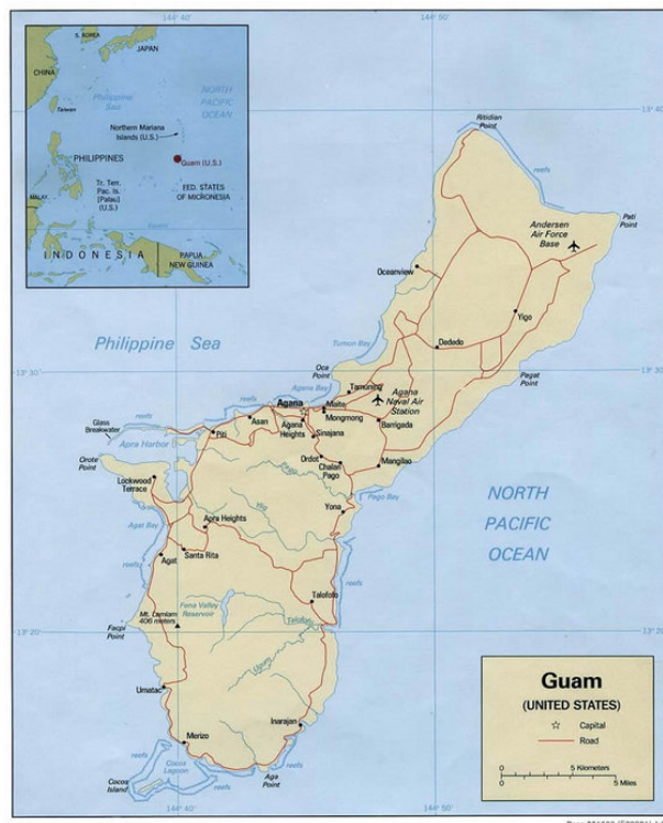
Map and location of Guam

In concrete terms, the plan not only sought to relocate all structural units of the Marine Corps, but to develop Guam into a major base of operations with joint use by the Navy and Air Force. As such, Guam would replace Okinawa as the true keystone of the Pacific, giving free rein to an integrated American global presence. It is natural to consider that the course this will take is that Okinawa-based Marines will be reduced to something like a remnant small branch, all the rest moving to Guam. (グアム統合軍事開発計画 より抜粋)