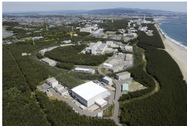
Tōkai nuclear power plants

MURAKAMI: Exactly. I saw this tendency more and more, and felt uncomfortable with it.