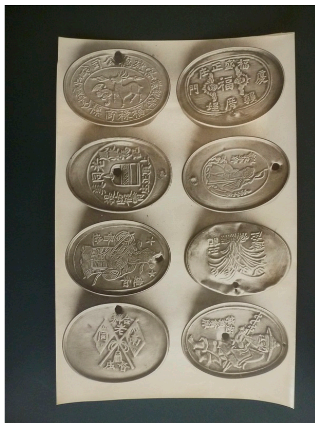
Figure 3: Opium Tins from China Confiscated in the Netherlands Indies, 1930.

An unintended consequence of this confluence of policies across neighboring regimes was the empowerment of a wealthy and savvy transnational opium investment network. Over the 1860s, 1870s, and 1880s, intense competition raged across southern China and Southeast Asia between the same groups of opium investors, as they either took over state tax farms or slipped into smuggling when the contracts were awarded elsewhere. These were also the decades during which opium cultivation expanded most rapidly across the Qing Empire, producing by the 1880s tens of millions of chests of the drug each year.