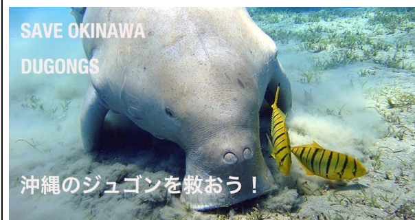
Illustration from the "Save the Dugong" International Campaign

protection suits in US history. The court is considering a US/Japan NGO appeal in the name of the dugong, in the case that began as "Dugong vs Donald Rumsfeld" against a Californian court's August 2018 ruling in favour of the government's construction plans. The NGOs insist that the government's withholding of crucial environmental information (especially the sea-bottom mayonnaise) should make its conclusion that the endangered adugong would not suffer "adverse effects" from construction improper and unwarranted. 41