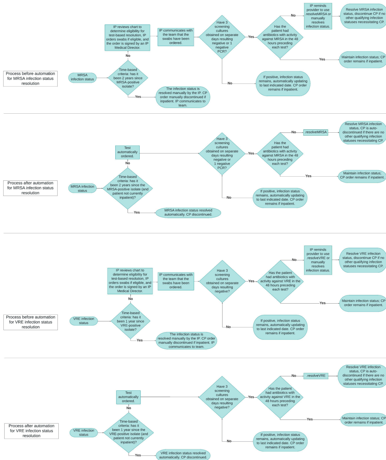
Figure 2. Process flow diagram of resolution of MRSA and VRE infection statuses, before and after CDSS automation

MRSA = methicillin-resistant Staphylococcus aureus . VRE = vancomycin-resistant Enterococcus . IP = infection preventionist. CP = contact precautions.