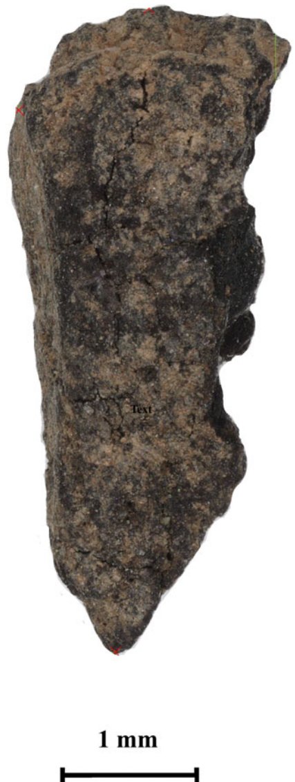
Figure 3. Early Middle Woodland domesticated sunflower kernel. (Color online)