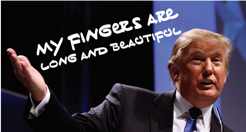
Figure 6. Tiny Hand as American StioB, targeting the inappropriateness of Trump’s comments through the silent materiality of the typeface.

semiquote of Trump’s words and thoughts and enables its users to highlight Trump’s deviant metapragmatic behavior and the absurdity of his political positions and thought processes. In alignment with a regime of visual evidentiality where information acquired through seeing (the manila folders, the large hands, etc.) is made ideologically salient, Tiny Hand users deploy the font to provide physical evidence of Trump’s stylistic and semantic inappropriateness and thus make the incredible tangible. As a mediatized graphic artifact circulating in a potentially endless variety of contexts, the font thus becomes a semiotic framework for articulating multidimensional and cross-modal commentaries on Trump’s political message and persona.