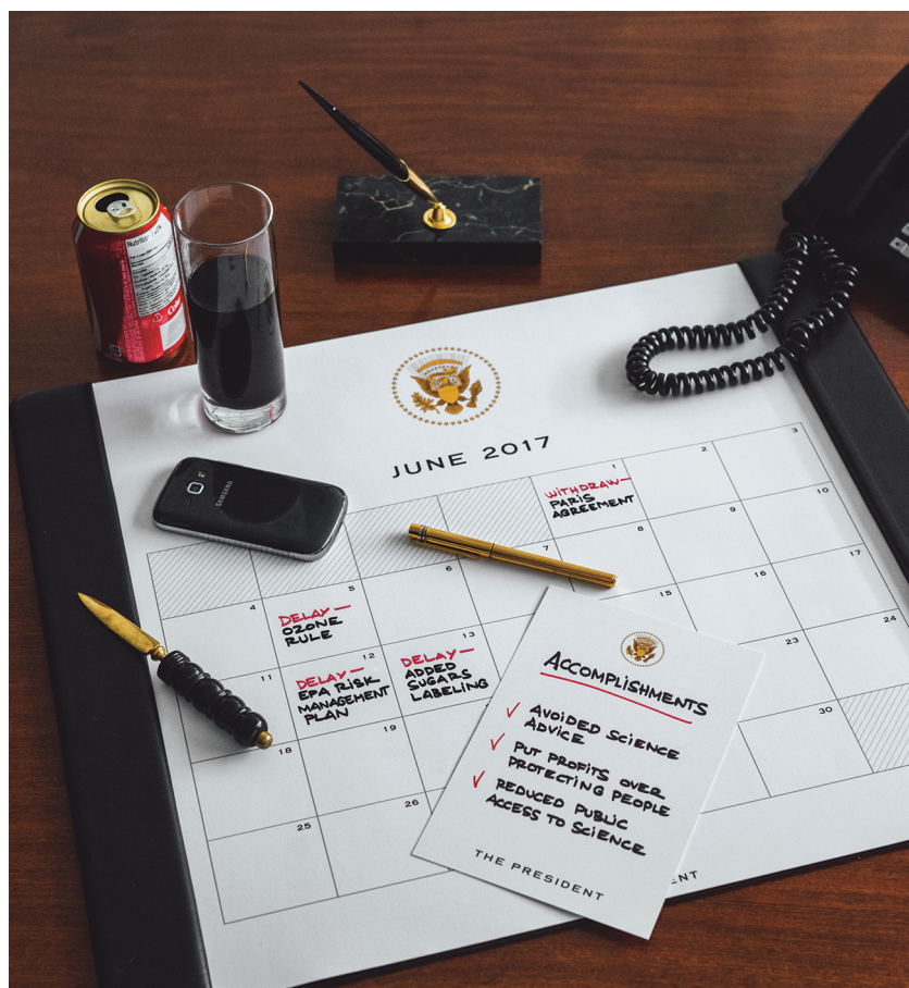
Figure 7. Trump's dangerous agenda, as imagined by Union of Concerned Scientists. (design by Allison Slattery/House 9 Design).

Typeface choices are never neutral but are inevitably "complicit in a range of cultural projects along various affective, ideological, and even political dimensions" (Murphy 2017, 66). Tiny Hand is no exception. However, unlike the