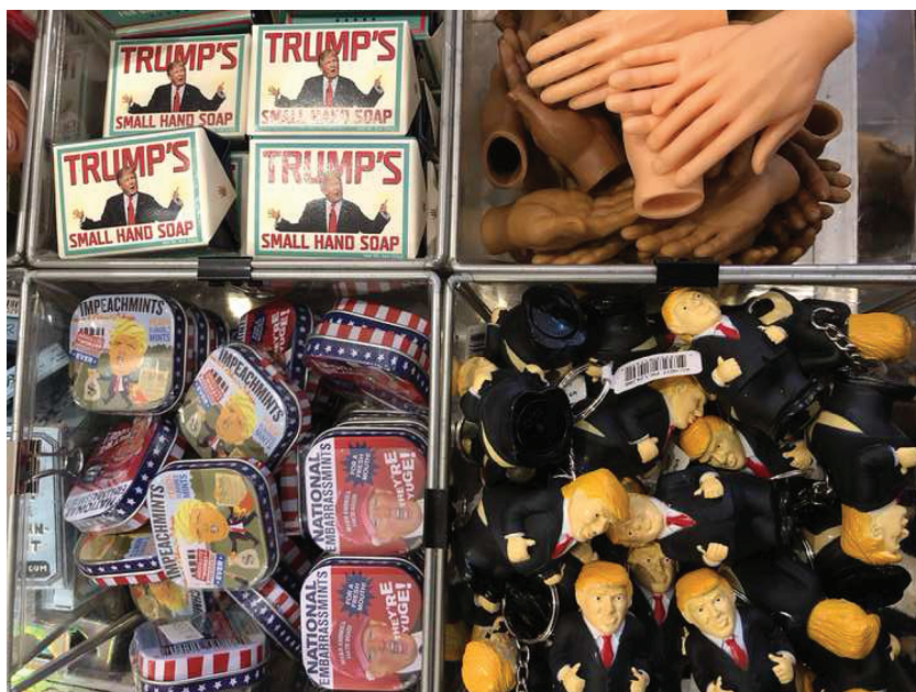
Figure 9. Anti-Trump gadgets for sale in a NYC gift shop: “Trump’s Small Hand Soap for Dirty Politics,” Tiny Hand pencil toppers, Trump poop key chain, “National Embarrassmints” and “Impeachmints.”

suggests that the intersection between metapragmatic discourse and graphic ideologies may offer an interesting domain of investigation—one that blurs the boundaries between the linguistic and the material.