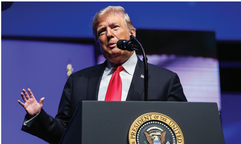
Figure 4. Trump small hands caricature. Courtesy of Isaac Woodbury High.

The origin of this reflexively politically incorrect and somewhat benevolent slur-turned-typeface can be traced back to the late 1980s, when Graydon Carter—then editor of the New York satirical magazine Spy —published the first critique of the size, shape, and proportionality of Donald Trump’s hands. More than twenty-five years later, this seemingly arbitrary line of critique resurfaced to feature prominently in the Republican primaries. In 2016, Senator Marco Rubio made a comment that linked the (allegedly diminutive) size of Trump’s hands to both the size of his phallus and the deficiencies of his character (see also Hall et al. 2016, 76). During an early campaign speech, Rubio attempted to rile up a crowd with an innuendo: “And you know what they say about men with small hands [meaningful pause], you can’t trust them!” Trump responded in kind, dedicating several minutes of a campaign rally to a refutation of the accusation. As he did during his first press conference as president-elect, theatrically pointing to a stack of manila folders placed on the table next to the podium as a way to give physical evidence of his commitment to distancing himself from his business interests (see Hodges 2017a, 2017b), Trump responded to the allegations