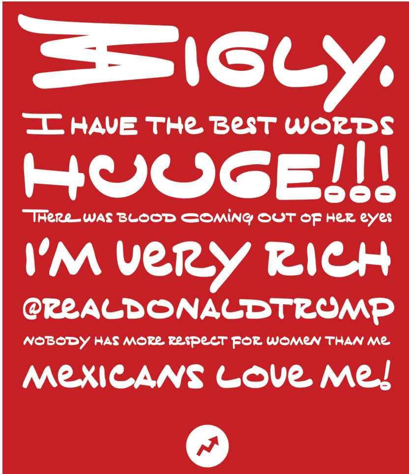
Figure 8. BuzzFeed’s Tiny Hand graphics did not only stylize Trump’s handwriting, but also stylized his voice through the reproduction of his signature utterances.

itself as a way to evoke his voice. The creation of Tiny Hand presumes the recognition of Trump’s handwriting. To aid this recognition, designers used formulas typical of Trump’s linguistic style. Within the American liberal public, the use of these utterances instantly renders the graphic artifacts (and, thereby, the font) indexical of Trump.