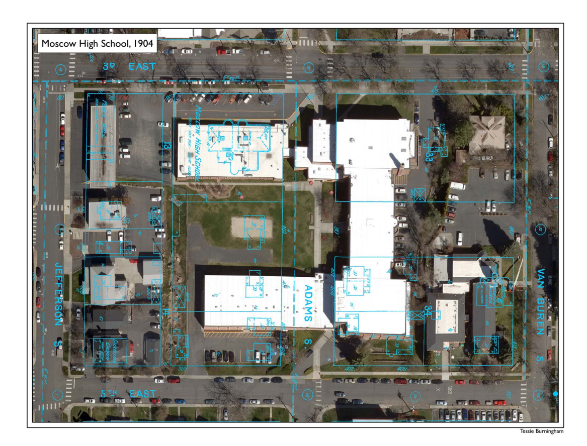
Figure 1. Present-day Moscow High School grounds with 1904 Sanborn Fire Insurance Map overlay.

Friday afternoons and all day on Saturday for a period of seven weeks. Such a timetable would (generally) fit into our university's scheduling and would allow for interested high school students to participate immediately after their release from school or on weekends.