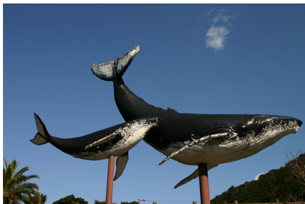
Entrance to Taiji

Six hours from Tokyo and accessible only via a coastal road that snakes through tunnels hewn from dense, pine-carpeted mountains, Taiji for years escaped the prying eyes of animal rights activists, but the isolation has been abruptly ended by the Internet and the cheap rail pass. A steady trickle of foreign protestors – most Japanese people know little about the tradition -- now arrives in the rusting town square to cross swords with local bureaucrats and the 26 fishermen who run the hunt.