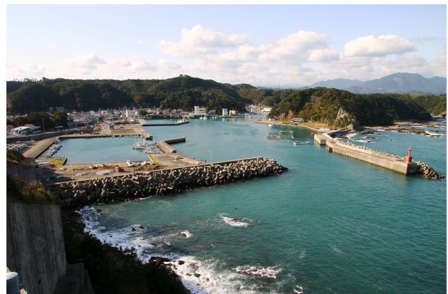
Long view of Taiji

Dolphin-hunting season has arrived again in