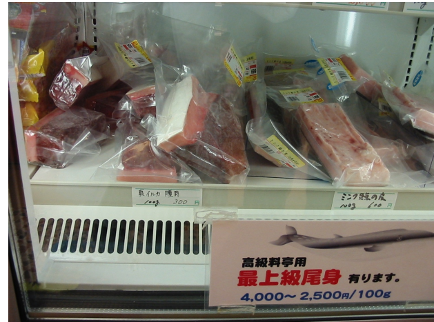
Dolphin meat (iruka, left) and humpback whale in Taiji market

According to local wholesaler Mizutani Ikuo, dolphin meat sells for about 2,000 yen (about US$16) a kilo, cheaper than beef or whale. Unlike most Japanese children, who have no idea what whale tastes like, Taiji kids know their cetaceans. "I don't like the taste of dolphin because it smells," says 9-year-old Utani Rui. "I prefer whale." Inside the museum, out-of-towners are often stunned to learn of the local tradition. "I'm shocked," says Shibuya Keiko from Osaka. "I couldn't imagine eating dolphin. They're too cute."