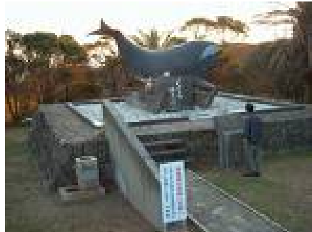
The Taiji Whale Museum

The schizophrenia is sharpest, say activists, in the Taiji Whale Museum, where tickets for "whale-watching trips" in dolphin-shaped boats are sold while the non-performing animals bump up against each other in a tiny concrete pool. Trainers here help sort the 'best-looking' dolphins from the kill and train them for use in circuses and aquariums across Asia and Europe.