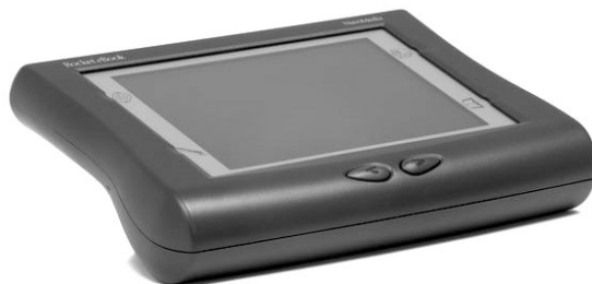
Figure I.1 Rocket eBook, © Mark Richards. Courtesy the Computer History Museum. www.computerhistory.org/revolution/mobile-computing/18/319/1721

them. This is not because it was love at first sight. I had commonplace opportunities to explore experiments in electronic publishing and squandered nearly all of them. Growing up, we had a family address book desktop-published using a GE TermiNet 1200 5 (when my father first became interested in desktop publishing in the 1970s, relevant reference books, such as Brian Kernighan and P. J. Plauger's Software Tools , 6 were sometimes sold with UNIX source code on an accompanying spool of magnetic tape). In my grade school library, CD ROM encyclopaedias sat next to the microfiche readers, and I found microfiche at least as intuitive and vastly more fun. I had a dim awareness of digital holdings in university library collections: things that weren't webpages but one would nevertheless read on screen (specifically, the screen of a humming dorm-computer-lab Macintosh Performa, or at best the candy-coloured clamshell of an iBook G3). But I have no memory of ever reading one myself, nor feeling any warmth or wariness or hostility towards these artefacts, nor having any opinion of any kind. Every encounter with the digital book hit the wall of my indifference and lack of imagination, until the Rocket eBook (Figure I.1).