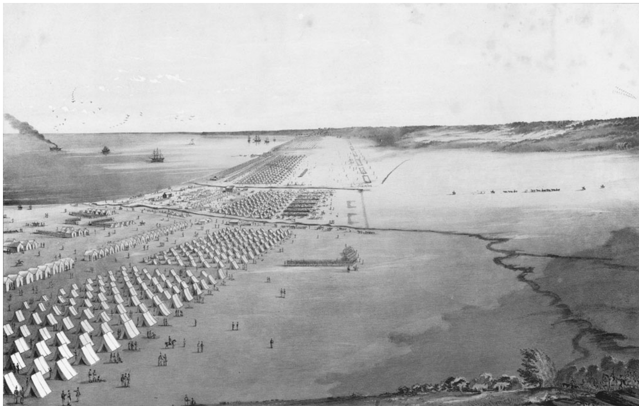
Figure 1. Daniel Powers Whiting's 1847 lithograph "A Bird's-Eye View of the Camp of the Army of Occupation" gives a sense of the enormity of Camp Marcy, but does not indicate how the depicted buildings were used. Public domain.