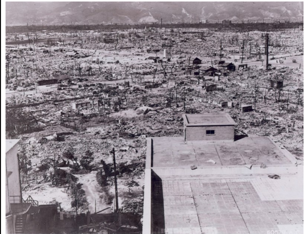
Hiroshima after the bomb. The view from the ground.

the ravages associated with radiation. 26 Finally, not only was the press tightly censored on atomic issues, but literature and the arts were also subject to rigorous control prior.