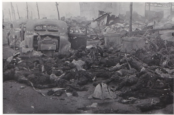
Bodies of people trapped and burned as they fled through a street during the attack on Tokyo on the night of March 9-10.