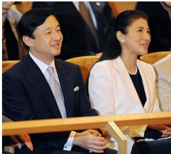
Naruhito and Masako

Engaged to her prince the next year, and married the following year, Michiko marked the triumph of love in a new age—Japan’s economy was on the brink of rapid growth, consumerism was rampant, and Michiko herself became another object to be consumed by a delightfully hungry public. As Amaterasu herself was sold to Genmei’s public, so too was Michiko packaged to become a utilitarian product, both existentially and physically. Over a million television sets were sold leading up to the royal wedding to allow a nation to partake in the spectacle of Michiko’s marriage, to consume her as “bride,” and Michiko was made into a fashion plate. Yet as such, one consumed Michiko not merely as product, but also as false consumer—What did she wear? How did she do her hair? What sort of goods did she like? How did she act as a crown princess or a wife? And, as time went on, how did she establish herself as the female head of a nuclear family?