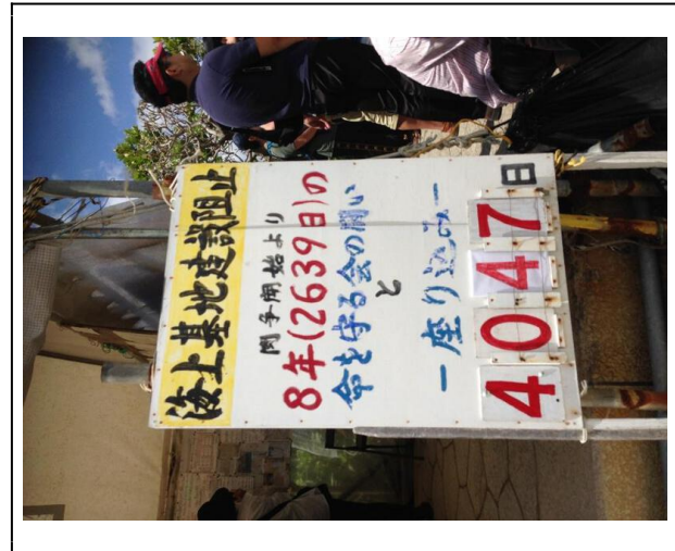
4047 days of sit-in