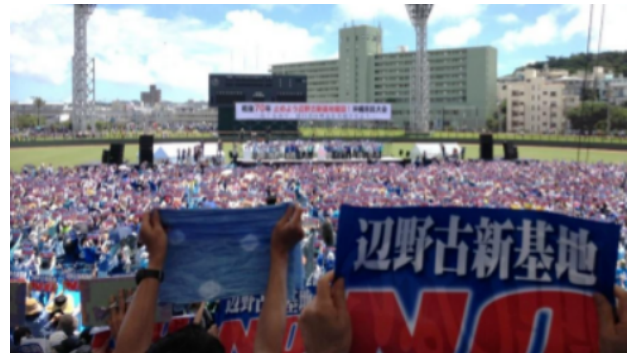
People raising cards saying "Henoko New Base: No" at the rally held at Okinawa Cellular Stadium on May 17, 2015.

Other comments indicate tour participants' solidarity with the "Okinawan struggle."