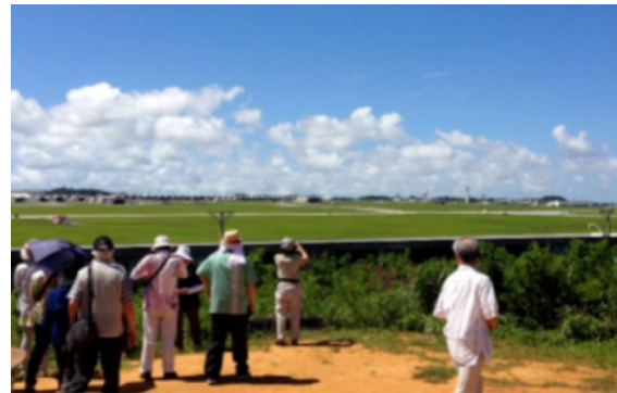
Kadena Air Base during the tour, May 2015.

would be shot while aiming for their heads. The upper body, on the other hand, offers a wider target. And other soldiers would have to care for the wounded, which further reduces their power. In this training range, the soldiers are training for war." (Interview 2015)