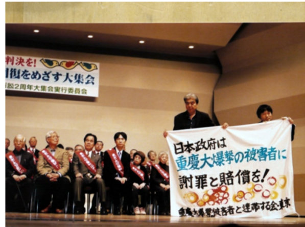
Supporters of a lawsuit demanding an apology and compensation to victims of Japan’s air raids on Chongqing, China.