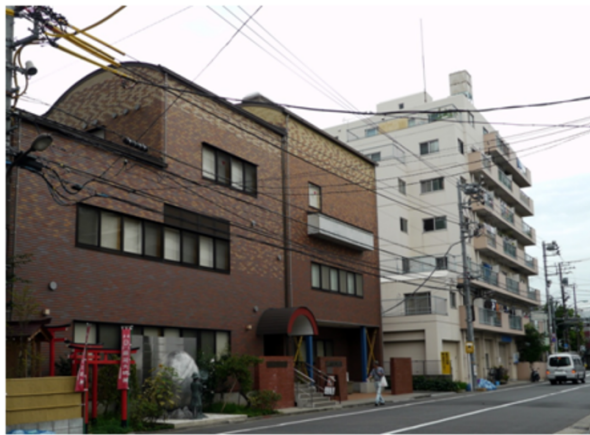
Center of the Tokyo Air Raid and War Damages, Koto Ward