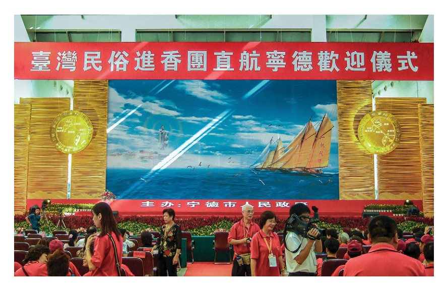
Fig. 9.1 The auditorium for the welcoming ceremony in Ningde

Apart from the pilgrims, the auditorium was full of officials from all levels, and media from the Ningde area and even Fuzhou. Leaders from both sides-the top administrator of Ningde and the county commissioner of Matsu-delivered long speeches brimming with visions of future political and economic interaction. They formalized their alliance by exchanging gifts, including votive tablets (bian'er) and local products (techan). In fact, such political alliances were stressed throughout the pilgrimage; wherever the pilgrims went, local government officials held banquets in their honor, and accounts and photographs of the numerous ceremonies during the trip were published in newspapers and on websites in Matsu, Taiwan, and China. The imaginations here differed from those expressed in traditional pilgrimages through religious symbols, legends of saints, or sacred topography (Turner 1967; 1968; Turner and Turner 1978); here, what made possible Matsu's imaginary of a mediatory role, or more specifically, its virtual recentralization, was the careful organization of rituals, the administrative and transportation privileges extended to the pilgrims, and the accounts of the journey rapidly disseminated by the media.