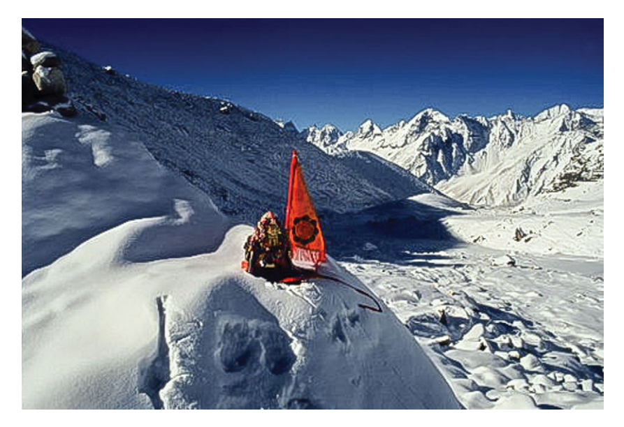
Fig. 9.4 Goddess Mazu heading for the peak of Mount Everest

pilgrimage. Indeed, the explorer was ceremonially sent off and heroically welcomed back with rituals, firecrackers, and drums.