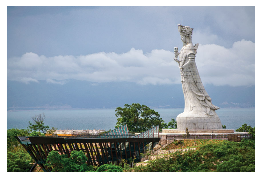
Fig. 9.2 The giant statue of Goddess Mazu on a boat