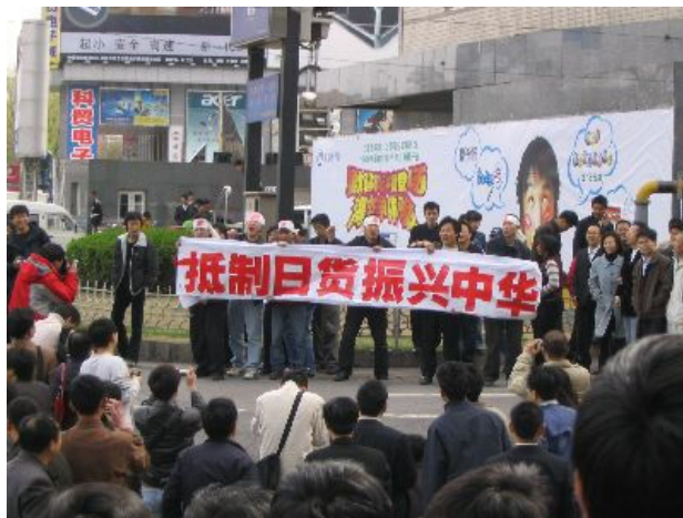
2005 Beijing demonstration calls for boycott of Japanese goods

There is no real public opinion in China. So-called 'public opinion' is all under state control, guidance and manipulation. If public opinion is not welcomed by the government, it will be immediately erased. If an opinion conforms to government views, then it will be encouraged. For instance, the government does not allow any street protest regardless of the reason, yet anti-Japanese protests alone were 'freely' conducted right in front of the military police.