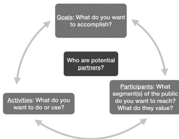
Figure 3 Visual representation of goal-directed design of public engagement with science, integrating consideration of goals, activities, and participants

The modes of engagement or activities in public engagement with science are similar to teaching and learning activities insofar as they are the things participants do or engage in in order to support achieving the established goal(s). Public engagement initiatives can involve a wide variety of different modes of engagement, and these different modes will be better suited to different goals. Modes of engagement can include, for instance, (1) traditional forms of science communication and journalism, like op-eds, public talks, news interviews, websites, and social media; (2) formal science education outreach to K-12 classes or teachers; (3) informal science education, such as activities at museums, zoos, libraries, and parks; (4) scientific research conducted in collaboration with members of the public, such as people volunteering to collect data about the birds in their backyards; and (5) outreach about science policy or to influence public policies. (This delineation of types of public engagement with science initiatives is developed in greater depth in Section 5. )