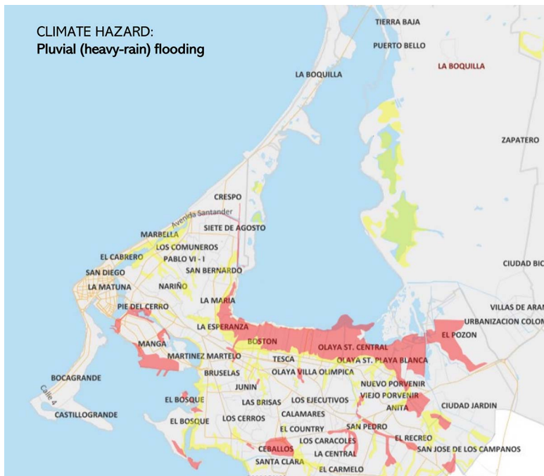
Figure 3. Risk map of pluvial flooding (due to heavy rain) with most severe impacts in the poor neighborhoods near the swamp of La Virgen. (Created with https://midas.cartagena.gov.co/ )

that regulate land use, and the inherited French civil code that regulates land acquisition (Table A.1 in Supplementary Materials). Like many cities, Cartagena was built applying colonial building codes and planning ideals from other bioclimatic zones, and deforesting and developing the coastal zone. It is not well adapted even to the present climate, and risk maps classify large parts of the city as high-risk. 5 While the Plan 4C produced maps for a wider range of hazards and scenarios, those displayed here (Figures 2 and 3) illustrate a heightened risk of pluvial (i.e., rain-induced) flooding for the poor neighborhoods near the swamp of La Virgen, while risk from coastal flooding affects most of the city's coastline. We found considerable pluralism in the selective application of the Plan 4C and in how formal laws compete with norms that determine everyday access to land and housing: from the "the law of the four poles," mobilized by the poor, to old titles from the colonial times, mobilized by the elite (see third subsection). According to a legal advisor to Cartagena's municipal council: