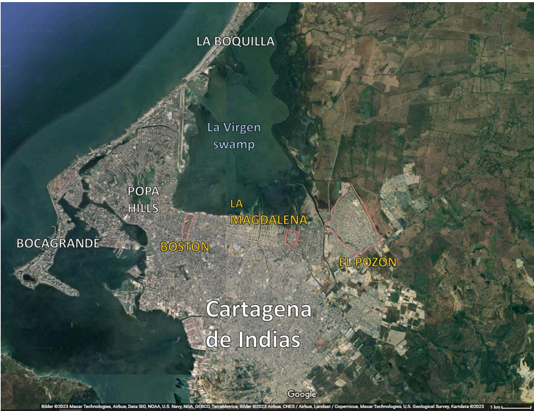
Figure 1. Map of the study areas (in orange) and the La Virgen swamp (blue). Other points of reference in white (Creation: Google Maps).