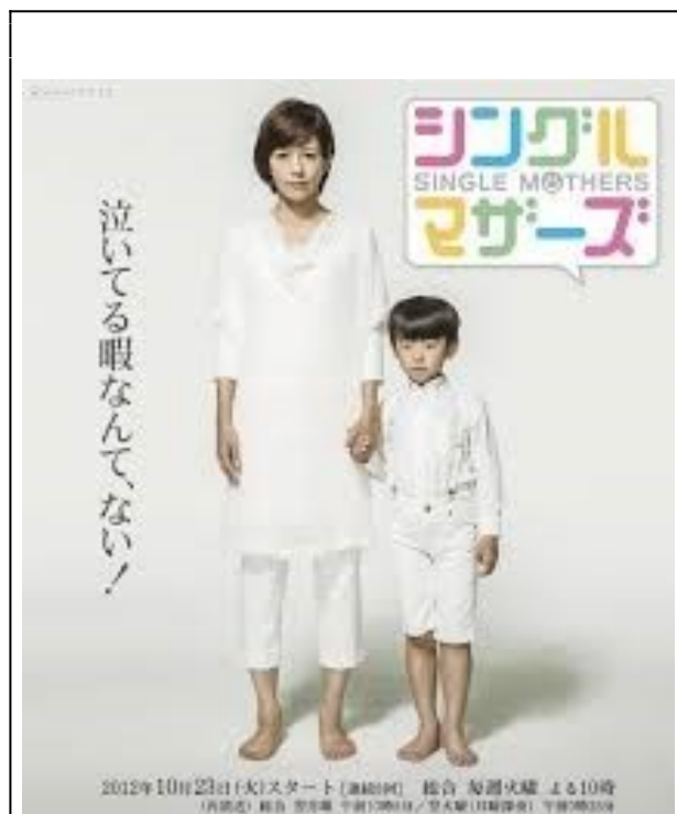
Advertisement for a television program

In practice, the Work Style Reform agenda essentially continues the strong push for employer-friendly reform made by Abe since the beginning of his prime ministership, with the usual re-marketing and a bit of reorientation. As seen in the table below, the agenda consists of nine items with the potential to greatly change employment practices in Japan; none are truly new, but the Abe Government has arguably pressed them harder than previous administrations. At least two other important reforms demanded by the LDP's backers in the employer community, kinsen-teki kaiketsu (monetary resolution, a scheme to enable companies to dismiss regular workers upon payment of severance) and expanded use of gentei seishain (limited regular employee, intended to be a an employment status midway between regular and non-regular employee), are not on the list, even though they are being intensively pursued