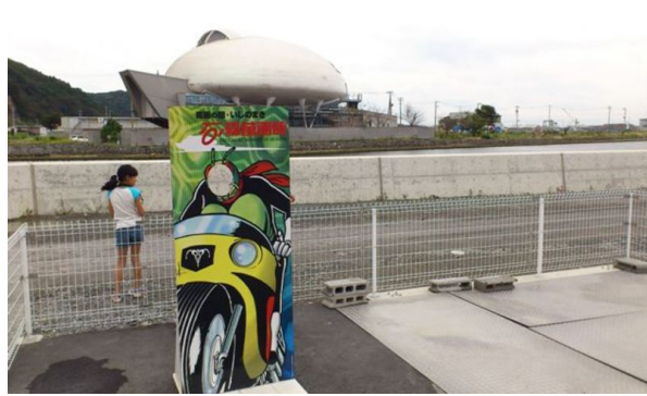
Fig.15: Photography OK: View of the ruined Ishinomori Mangattan Museum, Ishinomaki.

In any case, over a year after the disaster, when some of the worst evidence of devastation has been cleaned up and signs of reconstruction are apparent, it is not clear that the locals necessarily mind; at least not in the case of public sites. This was brought home to me during a brief visit to Ishinomaki, where I had lunch at a restaurant in the prefab Machinaka Fukkō Marushe mall opposite the island on which stand the ruins of what was once the Ishinomori Mangattan Museum. 22 In the spot where the view was best, there stood one of those figures with holes for visitors to put their face through to be photographed, popular at tourist attractions.