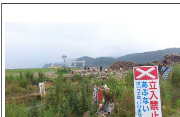
Fig.14: Access prohibited: Visiting the famous pine tree at Rikuzen Takata.

On Sunday 12 August I made my way by bus to Ichinoseki with a detour via Rikuzen Takata. Walking across the wasteland; the sheer expanse surpassed anything I had seen so far, as I came across a tour coach parked beside the coastal road. A stream of people, many with cameras, crossed the road and walked towards the sea, disregarding a notice prohibiting access to the area (Fig. 14). I soon realized that this was the site of the famous lone pine tree, the only one of an entire forest that remained standing after the tsunami; only later did I notice the signboard on the road pointing towards the “ kiseki no ipponmatsu .” 17 “Are they all tourists?” I asked a couple who had addressed me. They seemed faintly embarrassed at my question. “Most of them are probably volunteers,” I was told. This may well be true (although I had my doubts about the tour coach); after all I too was a volunteer of sorts, although not in Rikuzen Takata. What reason had I to be there, apart from wishing to see for myself the town I had heard so much about? “Disaster tourism” is an ugly expression, suggesting inconsiderate sightseers satisfying their curiosity and in the worst case hindering rescue work or exploiting the victims. 18 But, as so often, reality is complex.