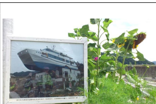
Fig. 10: Akahama, Ôtsuchi-chō; a photograph reminds of the boat stranded on a building, now it has been removed. There is talk of constructing a replica.

Ôtsuchi-chō, the place that attained dubious fame when a picture showing a sightseeing boat stranded atop a building went around the world in the wake of the tsunami (Fig.10, 11). Tōno Magokoronet and other volunteer groups had planted flowers among the foundations and our job was to weed these flowerbeds. Caring for flowerbeds in such a wasteland of destruction seemed a bit of a luxury. However as our guide, a volunteer from Kyoto, told us, contrary to popular image, volunteering is no longer about clearing up the debris. He pointed to the cemetery on the mountainside. 12 The Bon season was approaching, when people would visit the graves and while they attended to them the ruins of Akahama would be in full view. The flowerbeds among the ruins would signal hope amid the destruction.