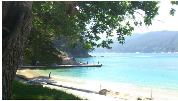
Fig. 8: Aragami beach, Yamada town.

That is not to say that the beach and the Aragami shrine had not visibly suffered. The shrine's torii looked as if it had been recently replaced and a small prefab meeting house looked intact, but the steps leading to the shrine path were badly damaged. We had been told that should a tsunami warning be broadcast (a transistor radio was switched on while we were working) we were to flee to the shrine precincts, since the water had not reached the shrine. But the very rusty box for offerings in front of the main hall made me wonder whether, like the heap of very rusty cars we had passed in the bus, the box had been immersed in sea water and the tsunami had in fact come close to the shrine building. As at Jōdogahama, a closer look at the area around the beach did reveal signs of destruction. But the sand looked clean, and even when we dug down into it and encountered tell-tale black markings that might have been caused by charred wood and other debris washed ashore, we did not in fact find any major debris. As a Kawai Camp veteran told me, however, this was in contrast to another beach where he had worked