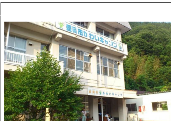
Fig. 4: Kawai Camp, Kawai, Miyako city.

The following morning I boarded the bus for Morioka, arriving at Kawai Camp just in time for morning assembly at 8 a.m. Some volunteers had come by bus from Morioka just for the day. Those who stay longer come from all parts of Japan; during the five days of my stay this included people from Fukuoka, Kanazawa, Kyoto, Hiroshima, and Tokyo as well as two from America. Between 25 and 31 volunteers (4-10 women, 17-25 men) stayed overnight at the camp, which has a capacity of 120 volunteers and at peak times accommodated around 90. At morning assembly, newly arrived volunteers were introduced by name and where they came from while departing volunteers were named and thanked for their contribution.