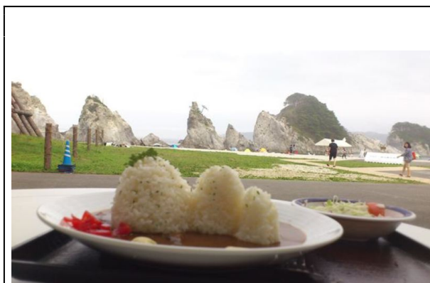
Fig. 1: Jōdogahama beach, complete with tourist amenities including a restaurant offering “Jōdogahama Curry,” is open to visitors again.