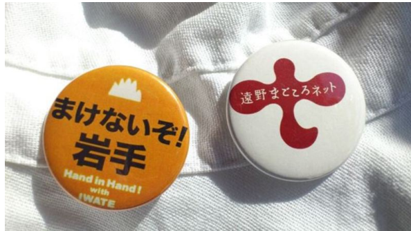
Fig.12: Badges sold to aid Tōno Magokoronet's relief projects.

The stage performances ended with a Buddhist rite to honour the dead conducted by local priests. Then everyone went down to the river to float the lanterns (Fig. 13). The way was lit by small lanterns created from PET bottles and Japanese paper. The bottles and paper had been lying in the corridor in the camp in Tōno over the last few days, with the invitation to make as many lanterns as possible by writing messages on the paper and folding it around the bottles. After the tōrō nagashi , we were asked to help with clearing up. Despite elaborate efforts to sort the large group of volunteers according to what time they hoped to take a bus back, there was confusion about the return journey. Eventually I joined the group boarding a bus at around 8 p.m. We took with us several plastic bags of garbage, carefully sorted in compliance with the rules of Tōno city, thanks to those volunteers whose job it had been to oversee garbage disposal, telling visitors exactly what to put in which sack or even doing it for them.