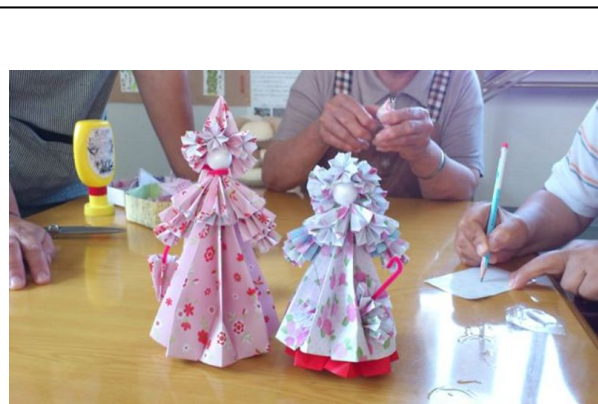
Fig. 7: Paper dolls folded by members of Kanan Niji no Kai, Kanan kasetsu jutaku , Miyako city.

On the second day we went to another kasetsu , Kanan. 9 This time nine women came in the morning and ten to twelve in the afternoon (including those who had come in the morning). They were a lively lot; as we watched the Olympics and chatted, I wondered whether they really needed us at the kasetsu . Kanan houses many people from the same community and they knew each other before the disaster threw them together in prefab housing. (It is more common for the residents in a single temporary housing unit to come from different communities, which makes it much more difficult for them to get along, organize activities in the temporary housing or plan for the future.) In the afternoon one of the residents brought material for making paper dolls (Fig.7). We were shown little carrier bags made for newspapers and given some as presents. They appeared to have a regular craft group going; one of my bags has a label saying that it was made by Kanan Niji no Kai in Miyako city Kanan kasetsu jutaku . Making, and possibly selling handicrafts, seems to be another occupation that is generally perceived as laudable; the two volunteers the previous day had passed around samples of craft items, presumably to encourage imitation.