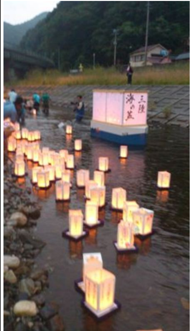
Fig. 13: Floating the lanterns, Kamaichi umi no bon, 11 August 2012.

The stage performances ended with a Buddhist rite to honour the dead conducted by local priests. Then everyone went down to the river to float the lanterns (Fig. 13). The way was lit by small lanterns created from PET bottles and Japanese paper. The bottles and paper had been lying in the corridor in the camp in Tōno over the last few days, with the invitation to make as many lanterns as possible by writing messages on the paper and folding it around the bottles. After the tōrō nagashi , we were asked to help with clearing up. Despite elaborate efforts to sort the large group of volunteers according to what time they hoped to take a bus back, there was confusion about the return journey. Eventually I joined the group boarding a bus at around 8 p.m. We took with us several plastic bags of garbage, carefully sorted in compliance with the rules of Tōno city, thanks to those volunteers whose job it had been to oversee garbage disposal, telling visitors exactly what to put in which sack or even doing it for them.