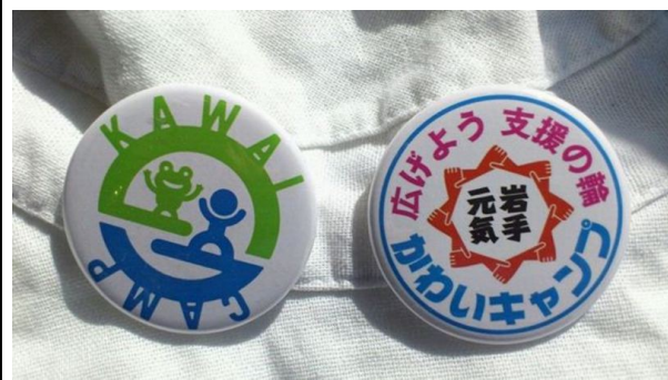
Fig. 6 Kawai Camp badges.

Kawai Camp is run by Morioka City in the building of the former Kawai branch of Miyako High School. It serves as a place for volunteers to stay from which they can organize the dispatch of volunteers to different locations in response to the needs communicated to the camp by the volunteer centres of Miyako, Yamada and other municipalities. A daily list of “needs” would be posted at around 6 p.m. and volunteers could sign up for the next day. On the day I arrived, most of the volunteers who had no special assignment were driven in minibuses to the welfare centre in Miyako, where another morning assembly awaited us and other volunteers, who had come directly to the centre. In the blazing heat (already at 10 a.m.!) we were taken through the radio gymnastics routine, before being driven, in groups of three, to the kasetsu jyutaku (temporary housing complexes, commonly simply referred to as “kasetsu” in local parlance) for activities described as a “salon.” This meant serving tea and cold drinks and socializing with whoever turned up in the common room ( danwashitsu in the smaller housing complexes, shūkaishitsu in the larger ones).