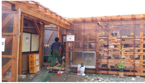
Fig. 9: Entrance to Tōno Magokoronet's headquarters and camp.

Tōno, a small town reached by a local train wending its way through the mountains, gained fame through Yanagita Kunio's (1875-1962) works on the rich folklore of the region, including Tōno monogatari (Tales of Tōno). Apart from the folklore museum, which was to host a symposium to commemorate the 50 th anniversary of Yanagita's death a few weeks later, most of the tourist sites are on the town's outskirts and conveniently explored by bicycle (rented from the tourist office). Tōno Magokoronet is organised by the local welfare authorities together with volunteers. It is financed by public money and donations. Like Kawai Camp it provides free accommodation and organises task forces in response to local needs. But the organization seemed to take more initiatives of its own (though presumably in consultation with local people), and volunteers from outside Iwate took long-term charge of projects.