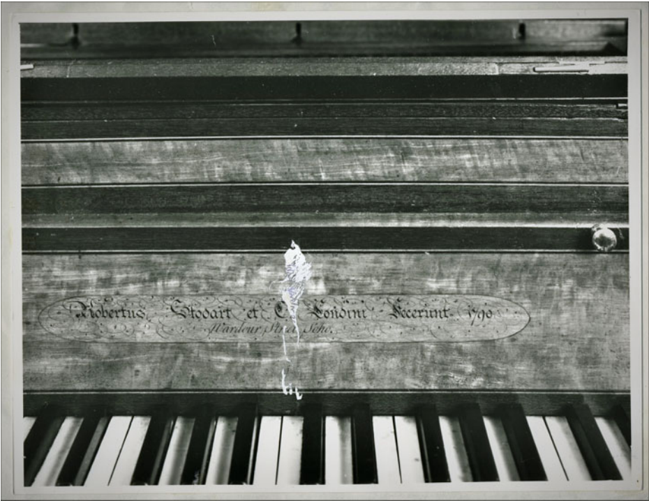
Figure 3a. Nameboard of Stodart pianoforte shown in Figure 1 . (The white mark appears on the archival photograph, not on the instrument.)