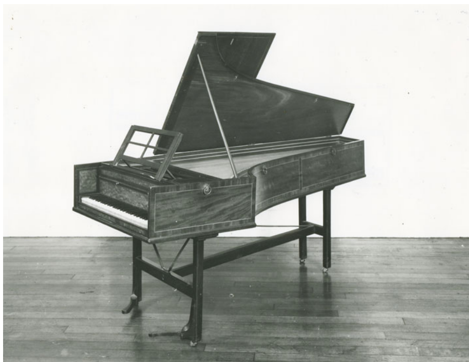
Figure 1. Pianoforte by Robert Stodart (London, 1790) in the Horniman Museum (M47-1982).

suggested by Chalmers's essay quoted above, it is quite feasible that this Stodart piano of '1799' was used for the 1934 festival. Incidentally, Beethoven worked on his first piano concerto between 1795 and 1800, and one cannot help speculating whether this may have been an additional factor in Arnold's decision to settle on 1799 as a possible date for the instrument.