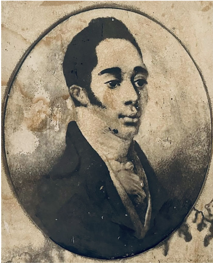
Figure 1. James Samuel Bannerman (May 6, 1790–April 23, 1858).

unrequited services” of about thirty years in “assisting the Government.” 2 These services included massive infrastructural and logistical projects. On the eve of the Gold Coast–Asante war (Nsamankow) of 1824, Pine recalled that then thirty-three-year-old Bannerman (see Figure 1 ), “garrisoned the Forts with 130 men paid, clothed, and equipped at his own expense” at a cost of £5,000. According to Pine, Bannerman was only given a paltry compensation of £500 “many years later” as a “cost of compromise” instead of the actual amount he had stated. A sympathetic Pine had to reiterate that he had no doubt Bannerman’s financial claims were accurate. 3