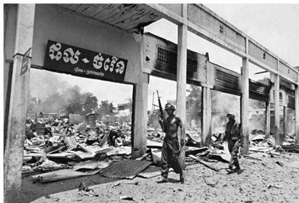
Soldiers patrol ruins of bombed out town in Cambodia

Khmer Rouge guerillas. 43 White House tapes reveal that President Nixon told Secretary of State Henry Kissinger to “go in there and I mean really go in....I want everything that can fly to go in there and crack the hell out of them.” After the conversation ended, Kissinger called General Alexander Haig to relay the new orders from the president: “He wants a massive bombing campaign in Cambodia....Anything that flies on anything that moves.” 44