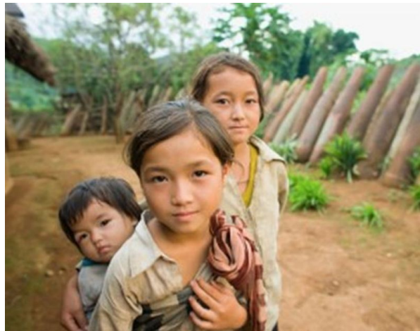
Millions of unexploded bombs remain in Laos