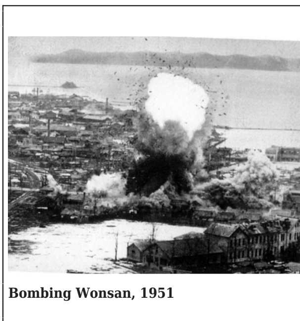
Bombing Wonsan, 1951