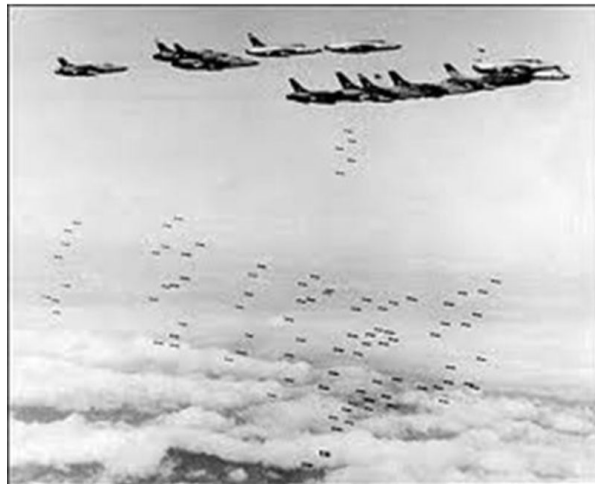
F-105 Thunder Chiefs in Rolling Thunder

the Johnson administration launched Operation Rolling Thunder against the North, its goal being to force a halt to the insurgency in the South and cut off supply lines. Rolling Thunder delivered 643,000 tons of bombs destroying 65 percent of the North's oil storage capacity, 59 percent of its power plants, 55 percent of its major bridges, 9,821 vehicles and 1,966 railroad cars. 30 Policy-makers claimed surgical precision; however, eyewitness reports pointed to the bombing of hospitals, schools, Buddhist pagodas, agricultural cooperatives, fishing boats, dikes and sanitariums, resulting in the death of an estimated 52,000 civilians. Nam Dinh, North Vietnam's third largest city, was "made to resemble the city of a vanished civilization," according to New York Times reporter Harrison Salisbury, despite being a center for silk and textile production, not war-related production. Vinh (population 72,000) was subjected to 4,131 attacks over a four year period, resulting in the destruction of nearly of all of its homes, 31 schools, the university, four hospitals and two churches. 31