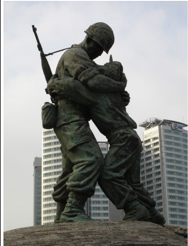
Monument in front of the Korean War museum in Seoul: Two brothers meet on the battlefield. Note the obviously hierarchic relationship between the armed South Korean (left) and the unarmed and much smaller North Korean (right). 2

On February 10, 2016, the South Korean government announced that it would close the Kaesŏng Industrial Zone (KIZ) in response to the North Korean nuclear test of January 6 th and the launch of a satellite on February 7 th . The zone, sometimes simply called by the name of the adjacent city of Kaesŏng, had been the last tangible outcome of the historic first inter-Korean summit of June 2000, which later that year had earned one of its two participants, the South Korean president Kim Dae-jung, the Nobel Peace Prize. His counterpart Kim Jong-il, who hosted the summit, received none. He was compensated generously by what has been rumored to be millions of dollars from South Korea. The payment was allegedly facilitated by Hyundai. 1 That is the same company that managed the Mt. Kŭmgang tourism project in North Korea, another successful joint project that has been frozen since 2008. Through its subsidiary Asan, Hyundai also built the Kaesŏng industrial zone.