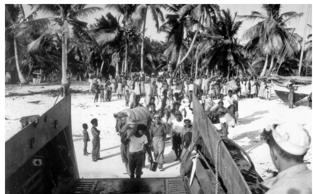
U.S. military forcibly evacuating Marshall Islanders from Bikini Atoll