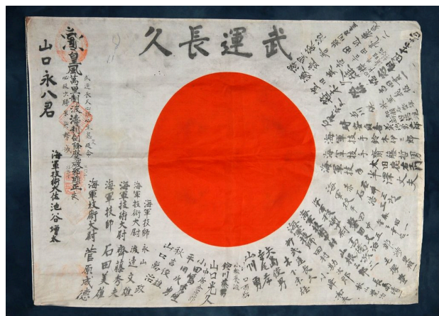
Signed Hinomaru flag of Eihachi Yamaguchi.

満月や水兵永く立泳 Mangetsu ya suihei nagaku tachioyogi A full moon tonight— sailors tread water for long, waiting and waiting. Note: The poem suggests sailors after their ship was sunk.