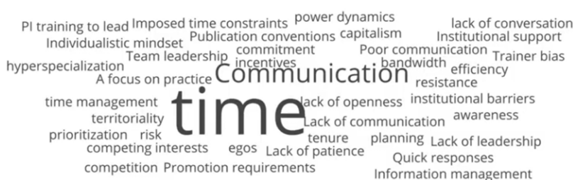
Figure 1. Team science barriers and facilitators. These word clouds were generated from polls of the audience conducted by Maritza Campo Salazar during the opening keynote. The top panel shows the facilitators of team science, and the bottom panel shows the barriers of team science based on audience input to the polls.

curious, find connections across disciplines, and embrace different methods and approaches. The speakers cautioned against devaluing differing approaches, emphasizing that structural views of teaming and microprocesses all contribute to the fabric of the SciTS. Hall and Stokols appealed to the audience to develop leaders and scholars who can utilize a pluralistic lens of evaluation to see promise outside of narrow lanes and bridge multiple levels of the scientific enterprise. The discussion ended with a closing precaution to be wary of geopolitical and narrow nativistic sentiments that may impact inclusionary practices and the study of interdisciplinary science.