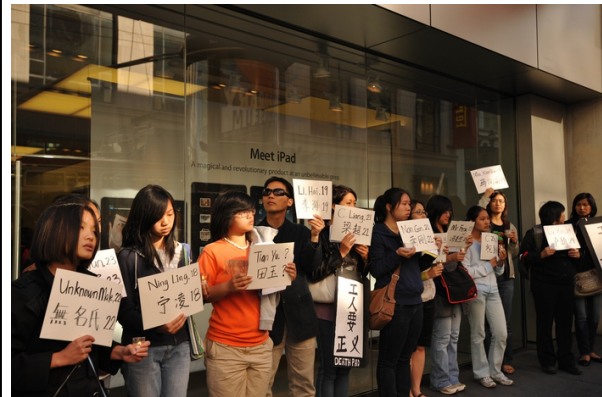
Thirteen young organizers picketed an Apple store in San Francisco on 17 June 2010. They carried placards showing the names and ages of 12 of the 13 Foxconn suicide victims whose names are known, and an unnamed placard for the 13th. They had a moment of silence for each of them. On the "DeathPad," reads "Workers want justice."

industrial accidents. 145 Still others, under desperate conditions, have taken their own lives. 146