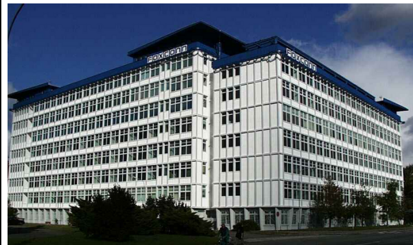
Foxconn Factory, Shenzhen

We can interpret Foxconn employees as having killed themselves to protest a global labor regime in which China provides the cutting edge. Under the reform and open-door policy, China’s export-oriented economy proved it could deliver economic growth. Asian-invested enterprises and domestic manufacturers on mainland China have risen quickly to become contractors and sub-contractors to Western multinationals, based on the exploitation of low-paid migrant workers. On the factory floor, work stress associated with the race to the bottom and the just-in-time production mode is intense. Suicide is merely the extreme manifestation of what migrant workers in their hundreds of millions experience. Some suicides may have been triggered by personal troubles, as Foxconn management would like to claim. But there is a broader social context shared by its workers and many others that underlies the desperate individual actions.