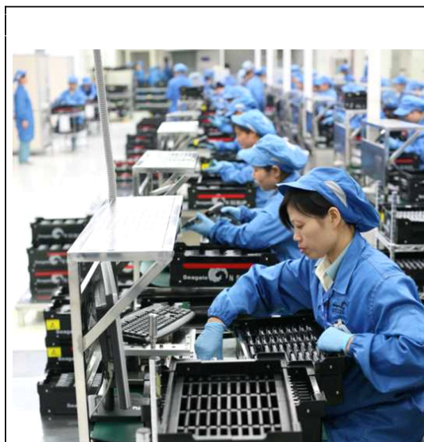
Foxconn workers on the assembly line

migration is driven by an urban-biased economic model. While there have been important, long-term demographic changes in the national working population as a result of the one-child family policy implemented beginning in the 1970s, successive generations of rural-urban migrants and the potential pool of migrants in the countryside have been and remain large. Chinese migrant workers have been incorporated within a global industrial labor regime.