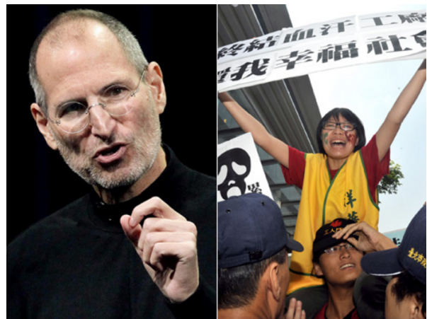
Will Apple and other corporate icons be able to distance themselves from the plight of Chinese workers assembling their products? Steve Jobs addressed the Foxconn issue at a press conference while a Chinese protester demanded equitable treatment for workers.

Apple, which enjoyed record profits amid the economic crisis, continues to seize every opportunity to secure lower prices from suppliers. Indeed, industry sources suggested that Apple awarded iPhone orders to Foxconn after Foxconn agreed to sell parts at “zero profit”. 99 Foxconn probably agreed to the deal in order to keep other more lucrative Apple contracts and to kill its competitors. It offered a rock-bottom price made possible by its big market size to secure a leading industry position. Apple revenues for the fiscal 2009 first quarter exceeded US$10 billion. 100