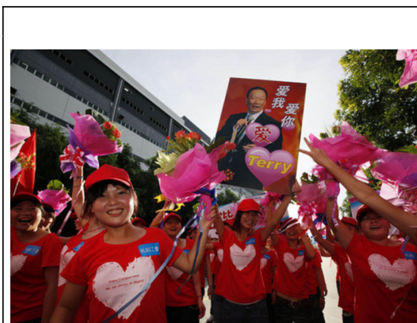
Love me, love you, love Terry

Amid new cases of young worker suicides this summer, Foxconn organized a morale-boosting rally for its young employees at a stadium in the Shenzhen Longhua plant on 18 August 2010. Some workers dressed in company-provided, pink-color t-shirts with big red words “I love Foxconn.” Others, in cheerleader costumes, held up huge posters of CEO Terry Gou that say “Love me, love you, love Terry.” 156