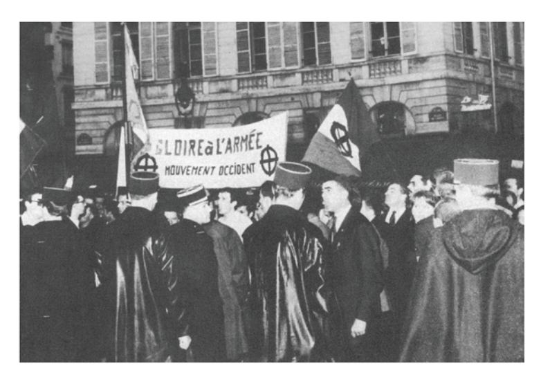
Figure 2. Protest at the Odéon in response to Roger Blin's production of Genet's Les Paravents. (From La bataille des Paravents: Théâtre de l'Odéon 1966, edited by Lynda Bellity Peskine et Albert Dichy)

The Screens opened on 6 April 1966 to an audience sharply divided between the Leftist supporters of the play and its opponents on the Right.<sup>2</sup> On 30 April, a group of over 30 veterans form colonial military forces and militants from the right-wing movement, Occident, interrupted the performance by throwing smoke bombs and glass bottles onstage, and then attacked the cast, who fought back with chairs and other props (Lavery 2013:169). On 7 May, the Occident group tried to set