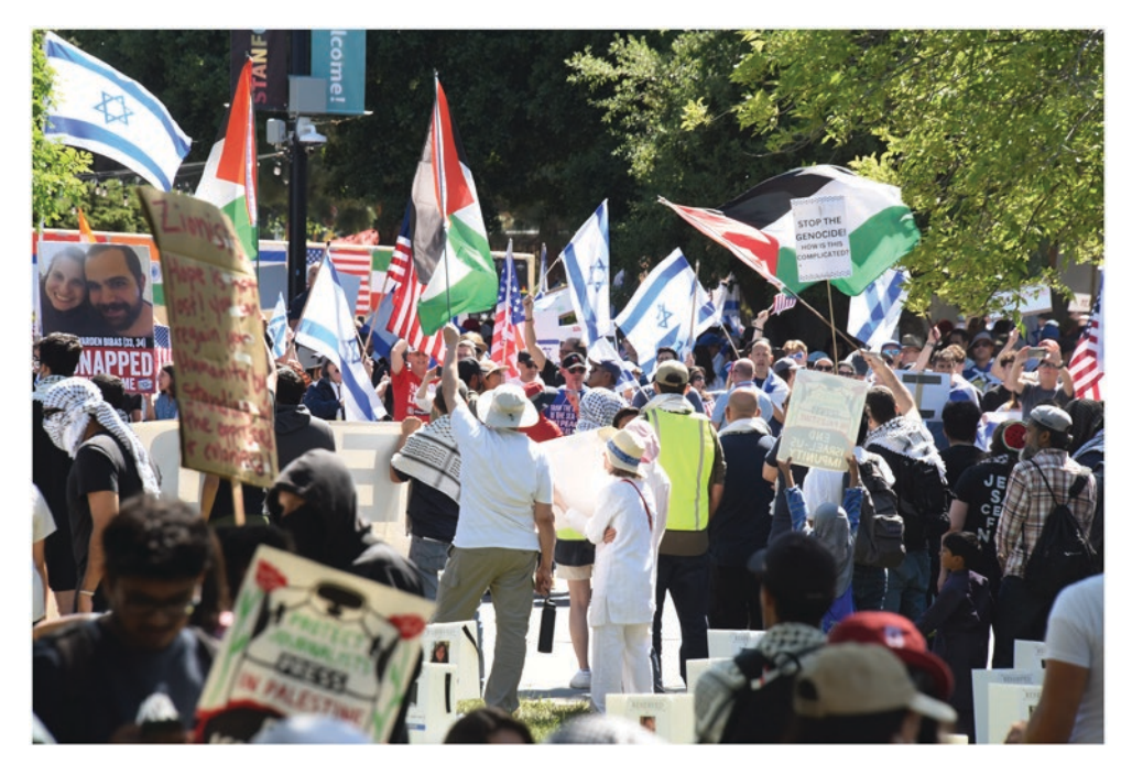
Figure 4: Battle of the flags. Stanford University, 14 May 2024.

the more zealous among them let that awareness slip into the open. The main ideological takeaway of the Gaza assault is the same as the ideological message that crystalized during the long backlash to the summer of 2020 in the US: in order to remain in power, a hegemonic formation—be it class, ethnic group, or caste—first needs to learn how to tolerate its own cruelty. Their words and actions are stating their credo loud and clear: my lifestyle is more important than your life .