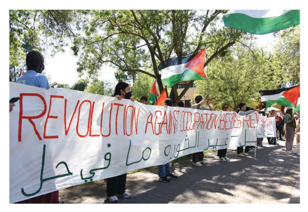
Figure 3: Stanford People's University stands strong against "interfascist forces." Stanford University, 14 May 2024.

The "battle of The Screens ," as the events surrounding the French premiere of the play came to be referred to, took place close to the end of the process of decolonization, which opened the way to the equally brutal process of recolonization.<sup>8</sup> Today, Genet's play can serve as a reflective surface that captures similarities between colonized Algiers and Palestine: an Arab land captured and absorbed by a foreign power (unlike other French colonies, Algiers was administratively a district of France), decades of domination, racism, and apartheid supported by massive military and police force. And it goes from there. This process becomes visible at certain points of inflection in different parts of the world, often marked by separations and cruelties reminiscent of Genet's play. The Separation Barrier in the West Bank, the wall along the US southern border, and the charred bodies of Blackwater "contractors" suspended from the bridge in Fallujah, Iraq: while these sites are scattered across the world, the imagery is strikingly reminiscent of The Screens . The breakdown of partitions surrounding the Gaza camp made many jump from their lawn chairs.