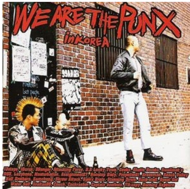
Fig. 1 Fig. 2

The title of the next scene compilation CD in 2003, We Are the Punx in Korea , however, already was shifting the focus significantly [Fig. 2]. “We Are the Punx” is written in much larger lettering than “in Korea” and the CD seeks to create allegiances with punks overseas and to set itself within a global context of a myriad