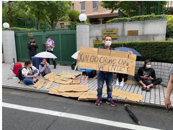
Vietnamese trainees asking for help in front of Vietnamese embassy in Tokyo, Japan.