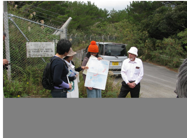
Author being briefed at the site of the Helipad Sit-In, Higashi village, Yambaru, Okinawa, 6 December 2009.

dual-runway and military port project of 2006, and having experienced the emptiness of the promise of economic growth in return for base submission, Okinawans were in no mood to be tricked again.