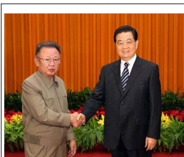
Figure 2: Kim Jong Il with China's Hu Jintao on May 20, 2010

However, after the false charge over the Cheonan Incident, North Korea completely changed its attitude. Having the great cause that the US and South Korea were to blame for the false charge, it began to openly criticize the evil acts of the US and South Korea in forums like the UN. A high Iranian official, who has repeatedly criticized US for falsely charging that Iran was developing nuclear weapons in the UN and elsewhere, began to praise North Korea, saying that Iran and North Korea "are both independent revolutionary nations, trying to resist the world's 'greedy powers.'" [Iran, North Korea share common goals]